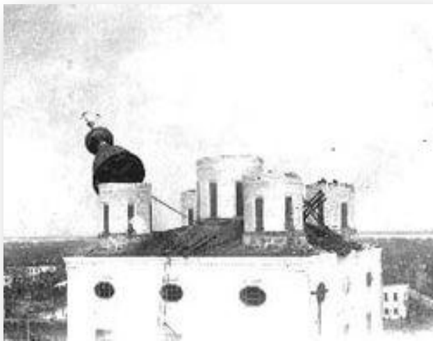
St. Trinity Cathedral