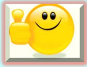
A - interesting