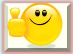
A - interesting