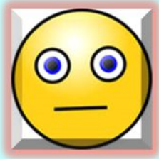
B - so-so