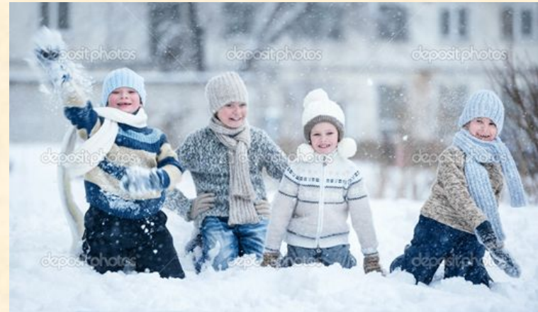
Playing in the snow