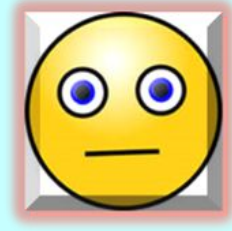
B - so-so