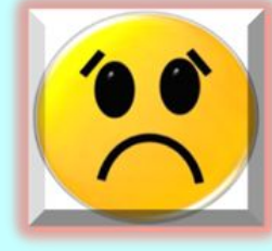
C - dull