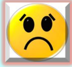
C - dull