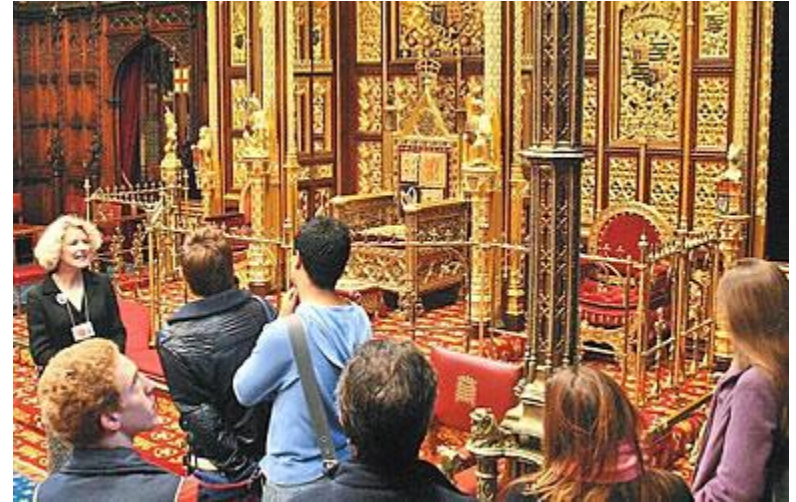
The throne in the House of Lords

The House of Lords is the upper house of the British Parliament. The main role of the House of Lords is to discuss carefully the new laws which are proposed by the House of Commons and to suggest changes when necessary. It can delay the passing of laws, but cannot stop them if the House of Commons wishes to go ahead. While the members of the House of Lords are in Parliament they may be taking part in a debate, examining laws in more detail in a committee, doing research, or perhaps dealing with a member of the public.