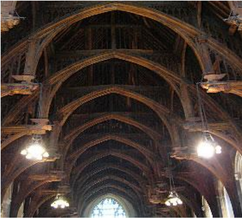
The medieval wooden ceiling of Westminster Hall (which survived the 1834 fire)

Westminster Hall was once used as a court. People who were put on trial here and condemned to death include William Wallace (1305), Guy Fawkes (1606) and Charles the First (1649). The high court moved to the Royal Courts of Justice (in the Strand) in 1825. Coronation banquets were held here until the rule of George the Fourth (1820-1830).