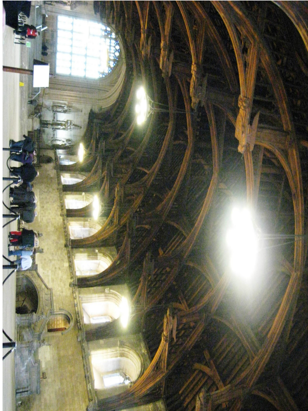
Great Hall inside Westminster Palace

I invite you to follow the route of a tour of the interior of the Houses of Parliament, starting at Victoria Tower and ending at the Great Hall. You can take a tour such as this in August and September each summer. This is when the parliament does not normally meet (unless there is an emergency) and is known as the Summer Opening of Parliament. There are no tours on Sundays or on the last Monday in August (a public holiday).