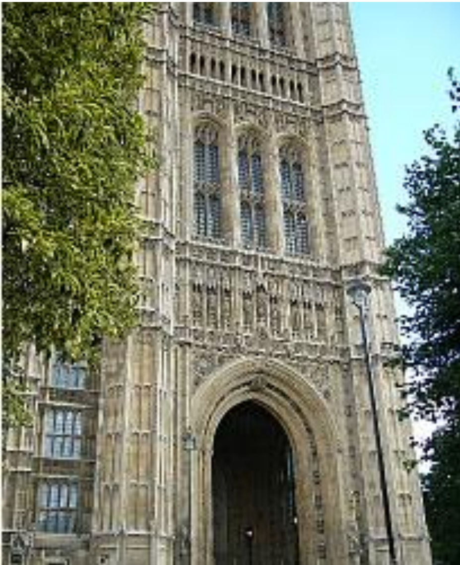
The Sovereign's Entrance at the bottom of Victoria Tower

Let's follow the route which the Queen takes once she has arrived for the State Opening ceremony.