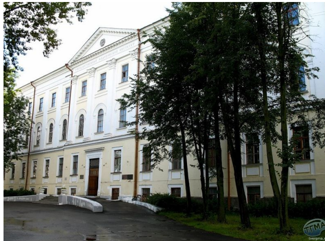
The Tver state medical academy