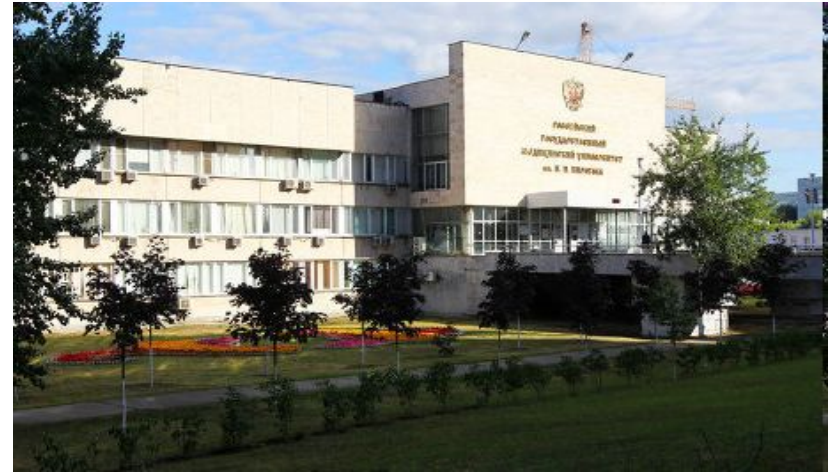
The Russian National Research Medical University by Pirogov