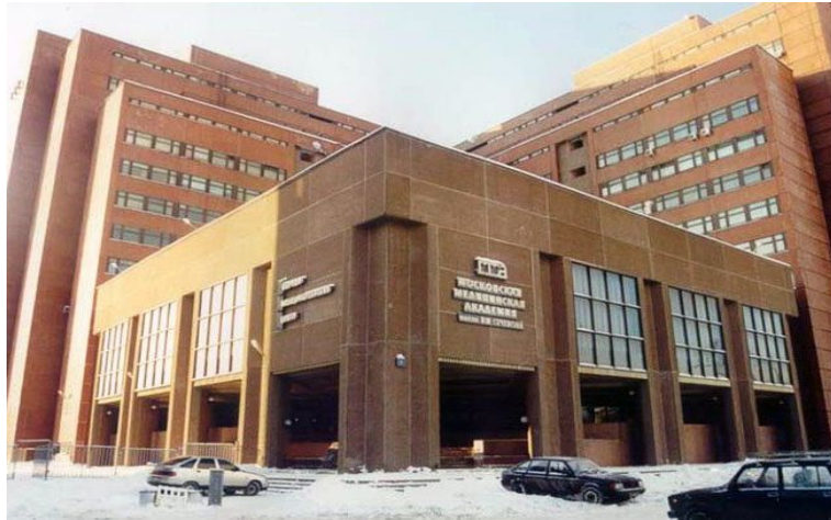
The First Moscow state medical university by Setchenov