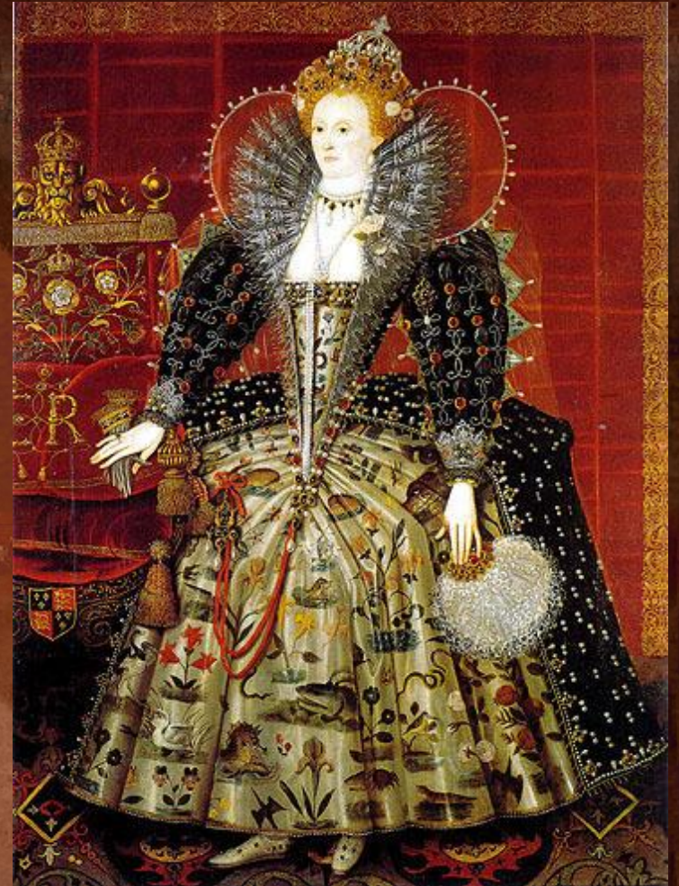
Nicholas Hilliard's workshop, queen Elizabeth I (a portrait in Herdvice, 1599)

Nicholas Hilliard was the court miniature painter of queen Elizabeth.