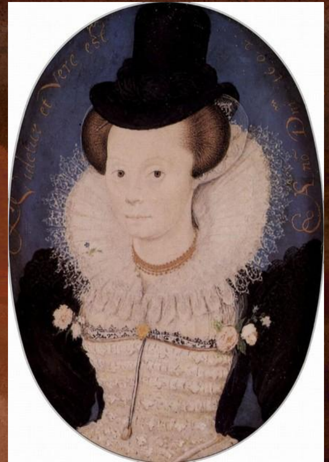
Portrait of the unknown person, 1602, London, Victoria and Albert's museum

The subtlety of performance of Hilliard's works admires. He was able to reproduce thin laces of a collar or a shining jewel.