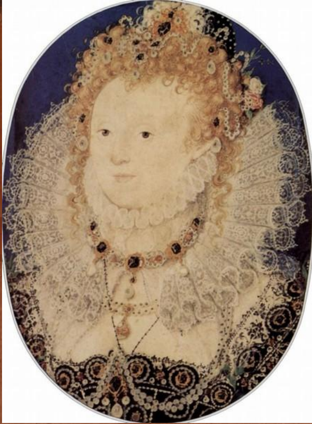
Portrait of English queen Elizabeth I, nearby 1590, Victoria and Albert's London museum

Technically he was very conservative according to European standards, but his paintings are superbly executed and have freshness and charm that has ensured his continuing reputation as "the central artistic figure of the Elizabethian age, the only English painter whose work reflects, in its delicate microcosm, the world of Shakespeare's earlier plays".