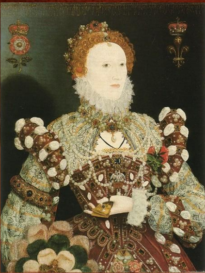
Portrait of English queen Elizabeth I, nearby 1590, Walker Art Gallery, Liverpool