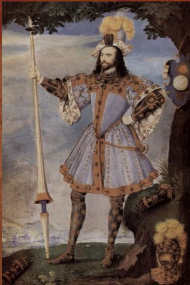
George Klifford's portrait, the column of Cumberland, nearby 1590, London, a national sea museum

Nicholas Hilliard was an English goldsmith and a limner best known for his portrait miniatures of members of the courts of Elizabeth I and James I of England. He mostly painted small oval miniatures, but also some larger cabinet miniatures, up to about ten inches tall, and at least two famous half-length panel portraits of Elizabeth.