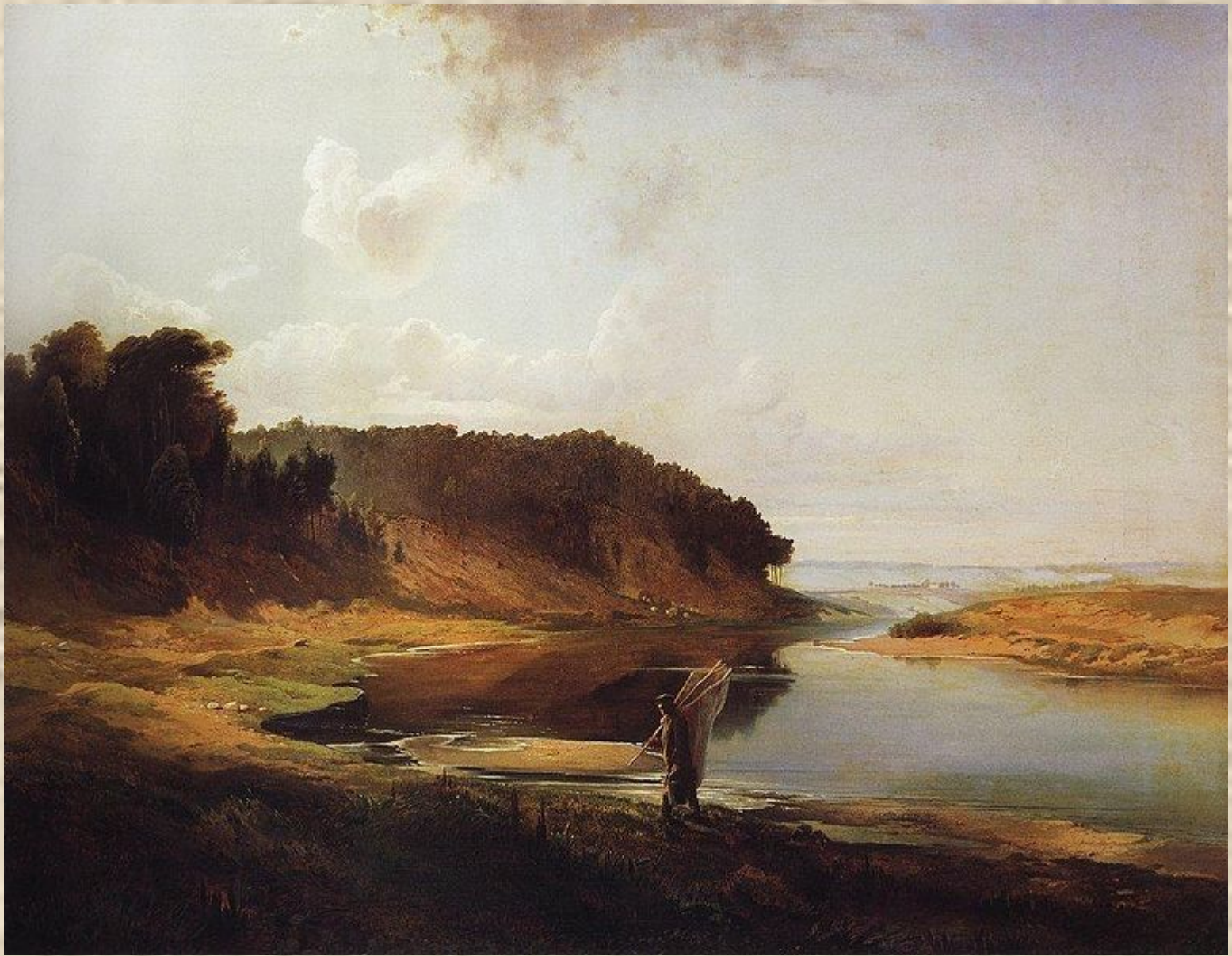
Landscape with River and Angler (1859).