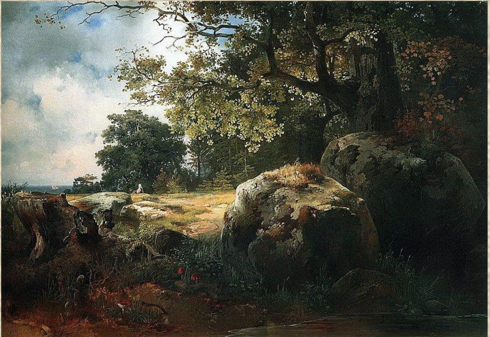
View in the Neighborhood of Oranienbaum (1854).