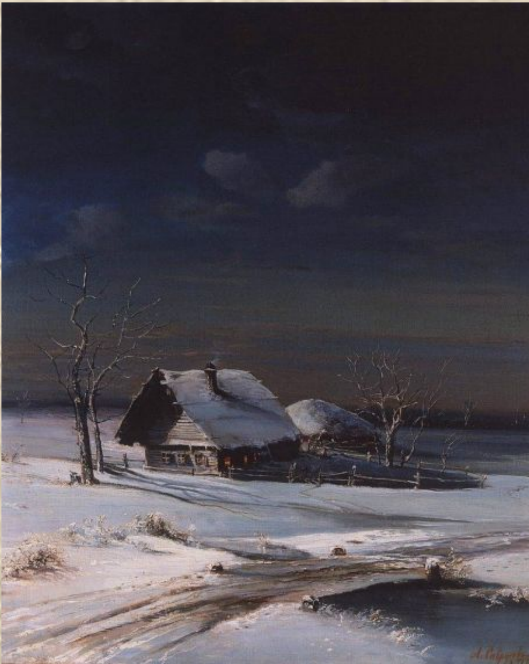
Winter landscape. (1871)