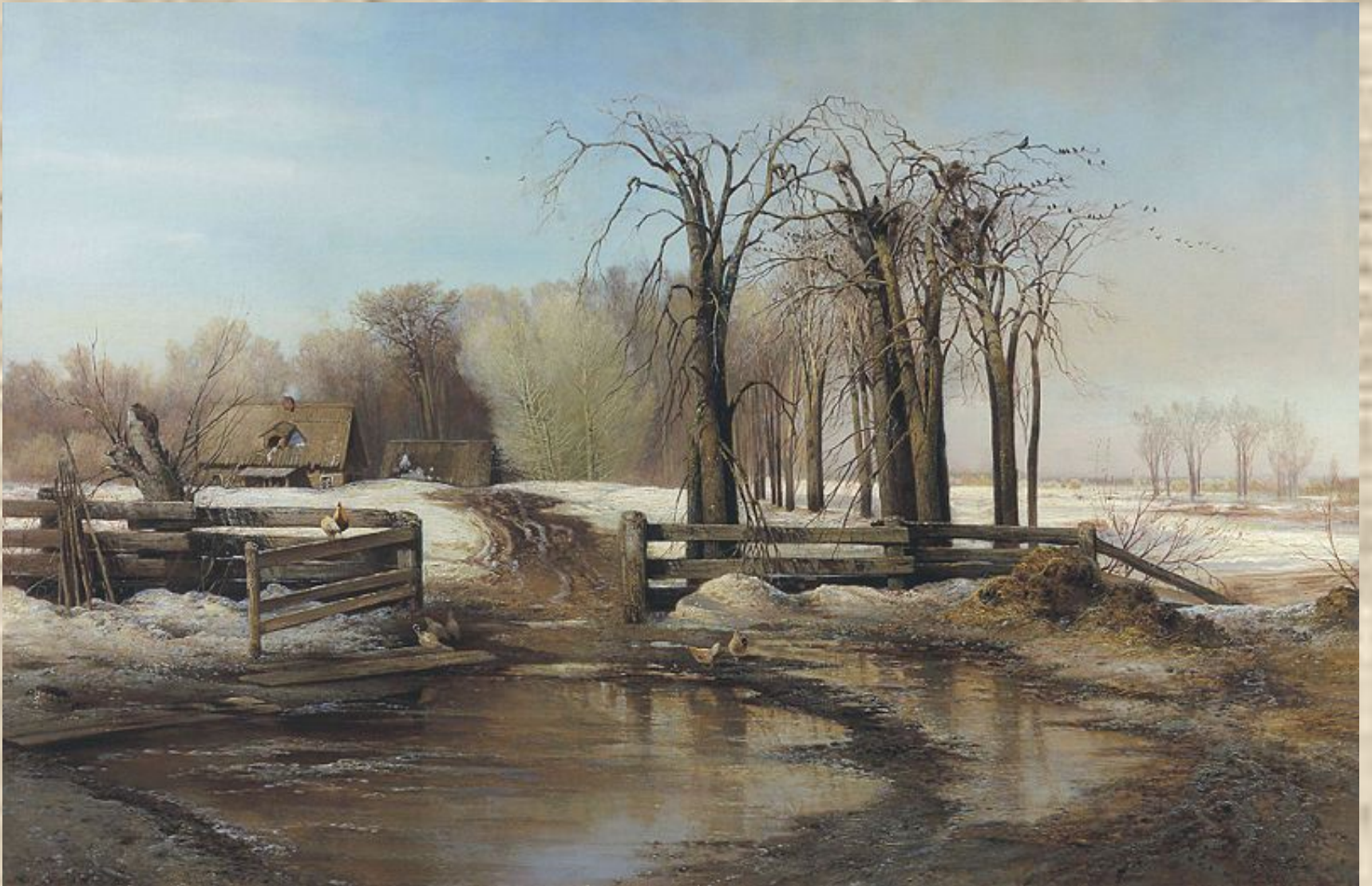
Spring Day, 1873