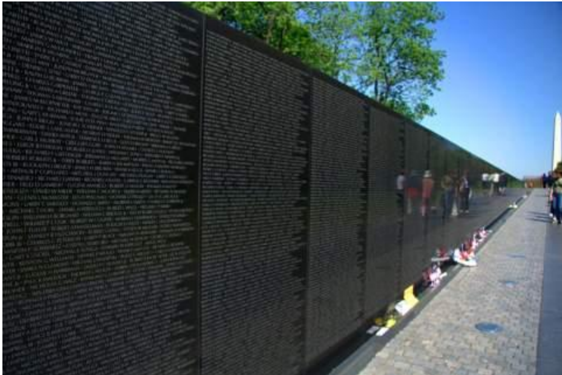
Vietnam Veterans Memorial

Political buildings and monuments can be seen all over the city centre.