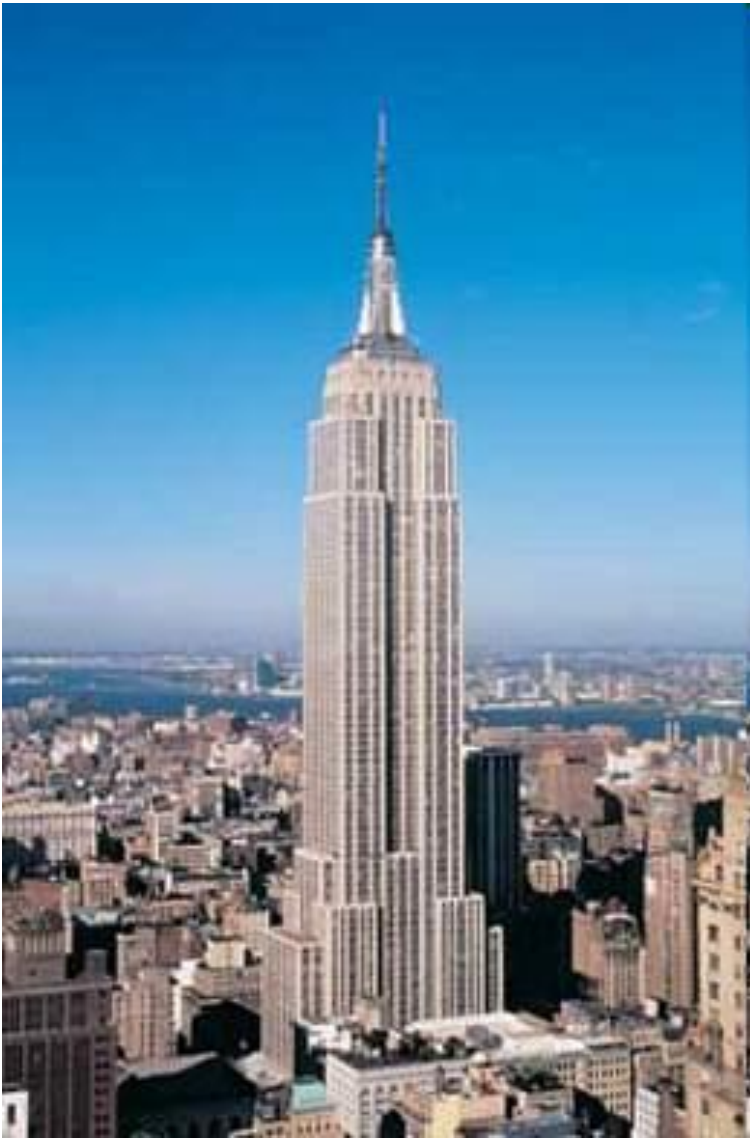
The Empire State Building