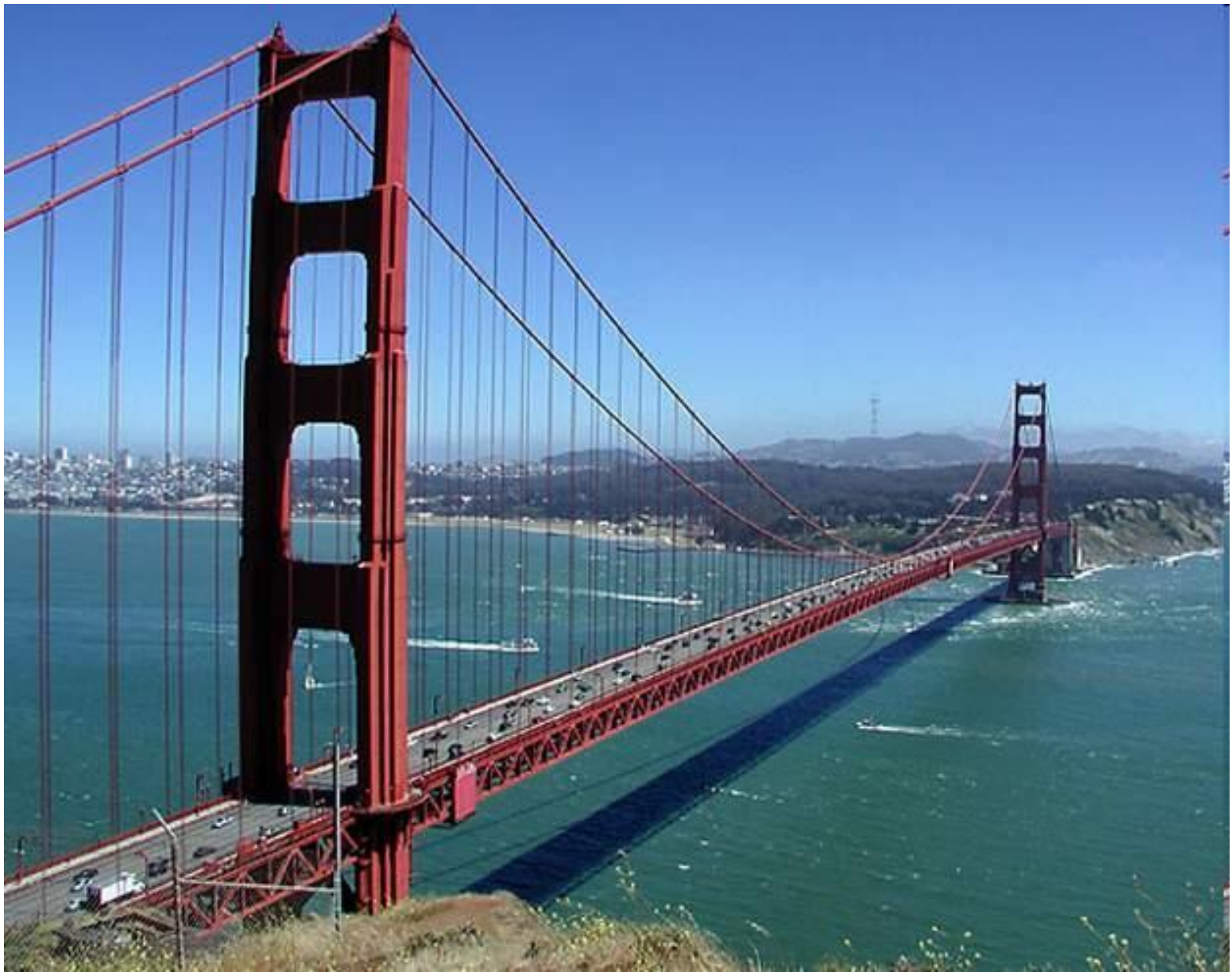
Golden Gate Bridge