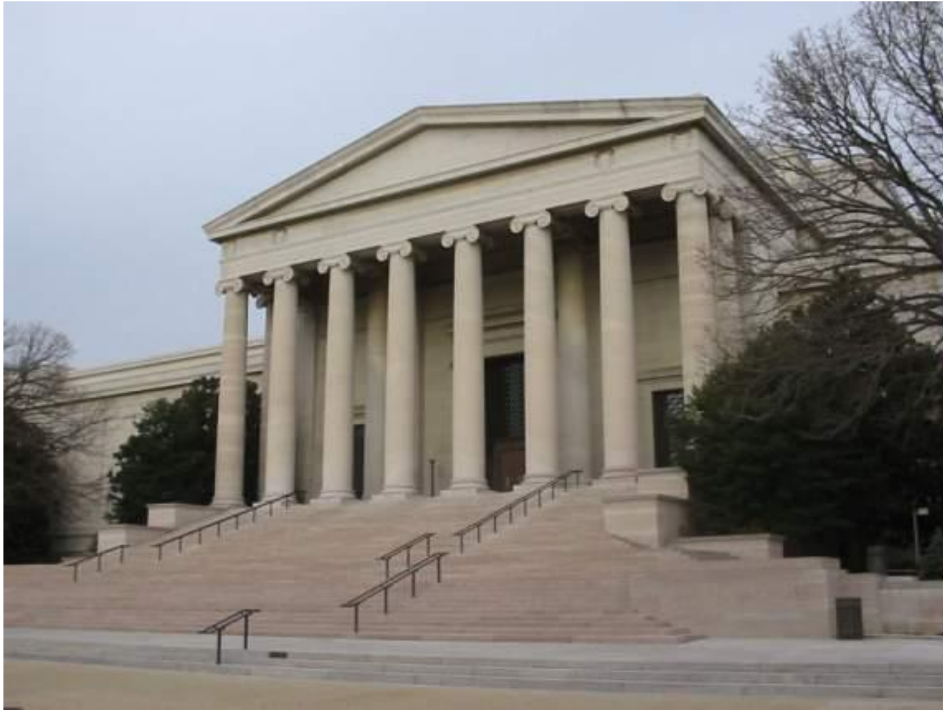
National Gallery of Art

In Washington we can visit some of the finest museums in America.