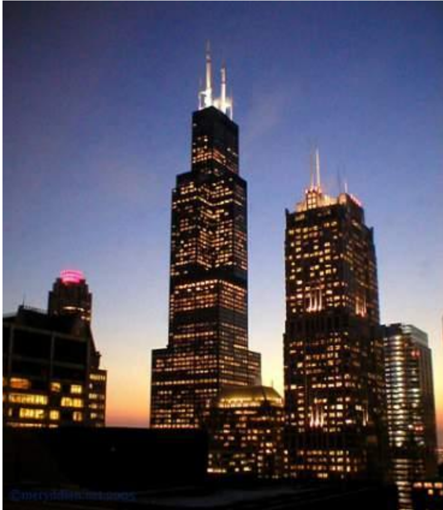
The Sear's Tower

In 1871 there was a big fire that destroyed Chicago, but it was rebuilt and now there are lots of skyscrapers, including the tallest skyscraper in America: the Sear's Tower – with over 100 floors.