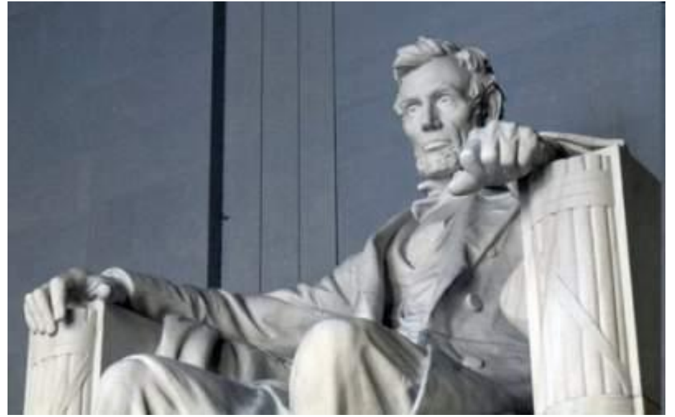
Abraham Lincoln Statue