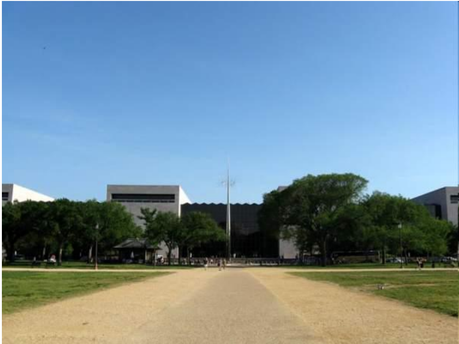
National Air and Space Museum