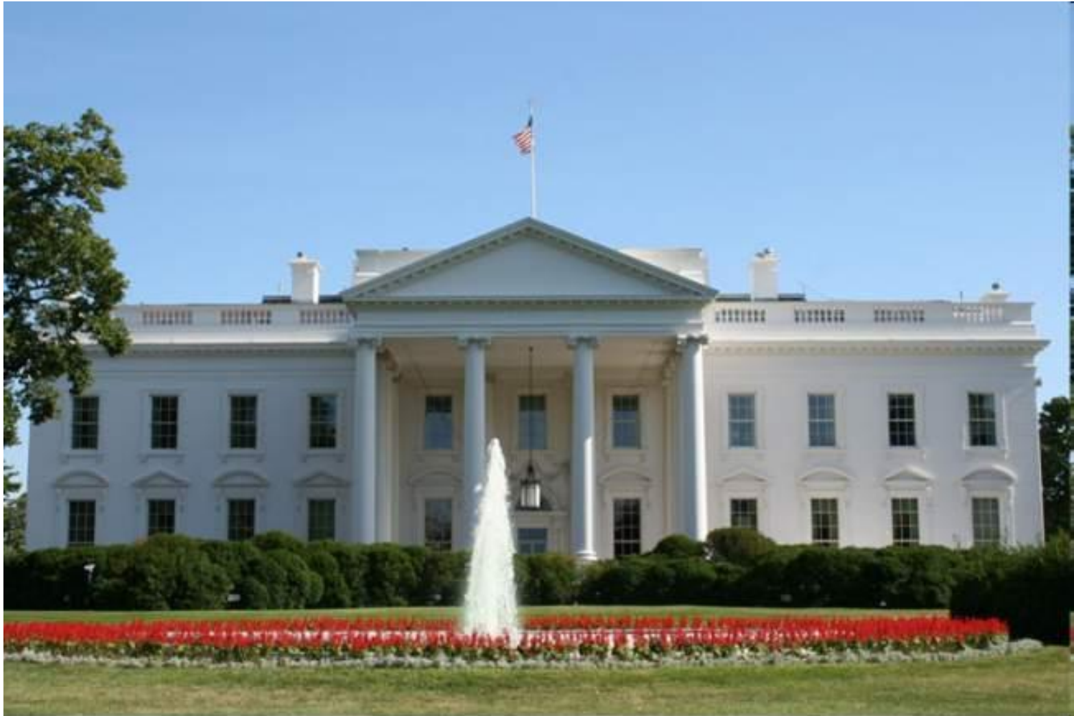
The White House