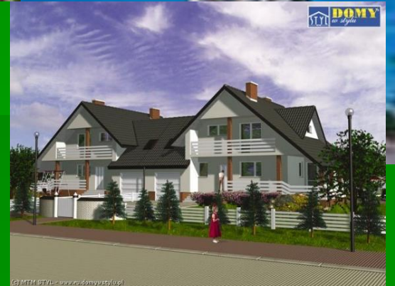
A detached house