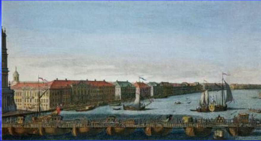
English embankment 1753