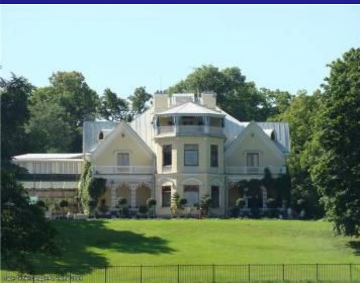
Парк Александрия, Коттедж