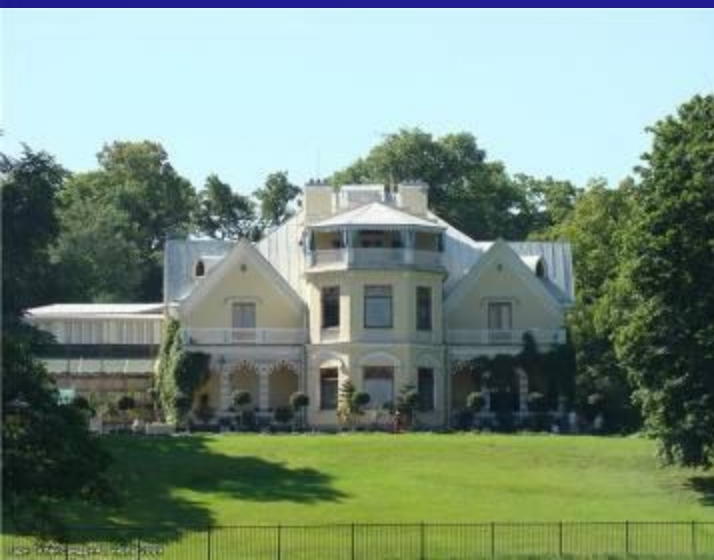
Парк Александрия, Коттедж