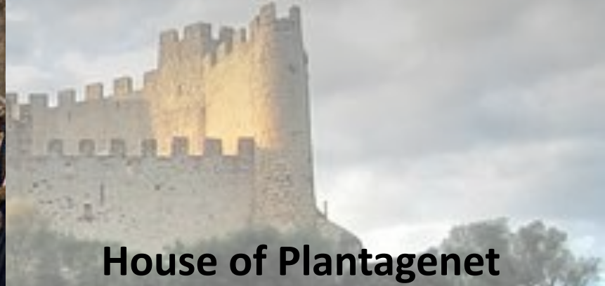
House of Plantagenet