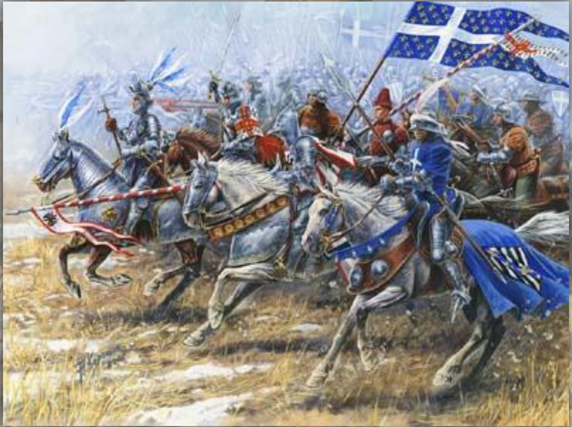
King of England Richard I (1157 – 1199)