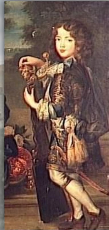
Alix of France (1151 – 1167)