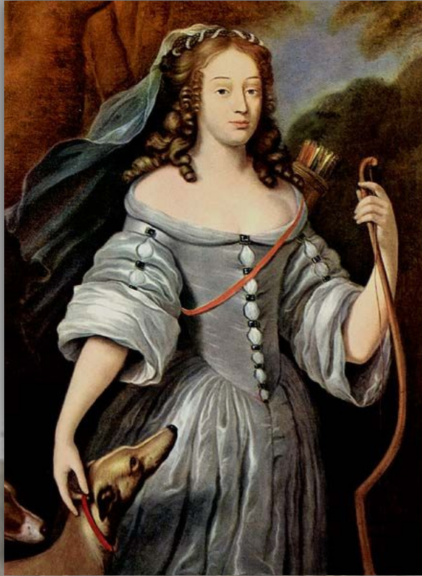
Marie Capet (1145 – 1198)