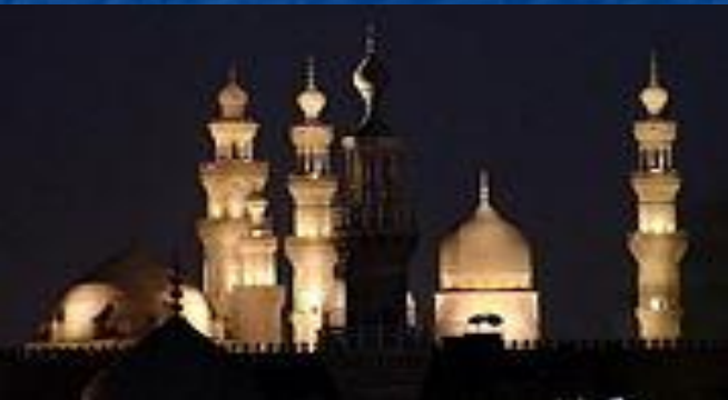
Cairo's unique cityscape with its ancient mosques