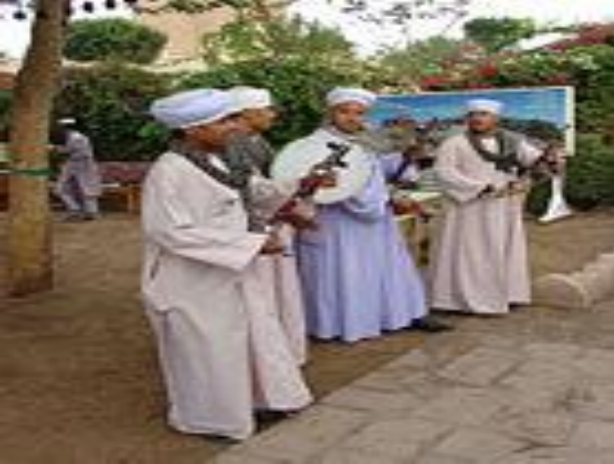
Upper Egyptian folk musicians from Kom Ombo .

Egyptian music is a rich mixture of indigenous, Mediterranean, African and Western elements. Egyptian