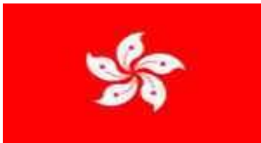
HONG KONG CHINA