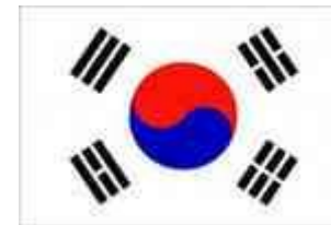
The Republic of KOREA