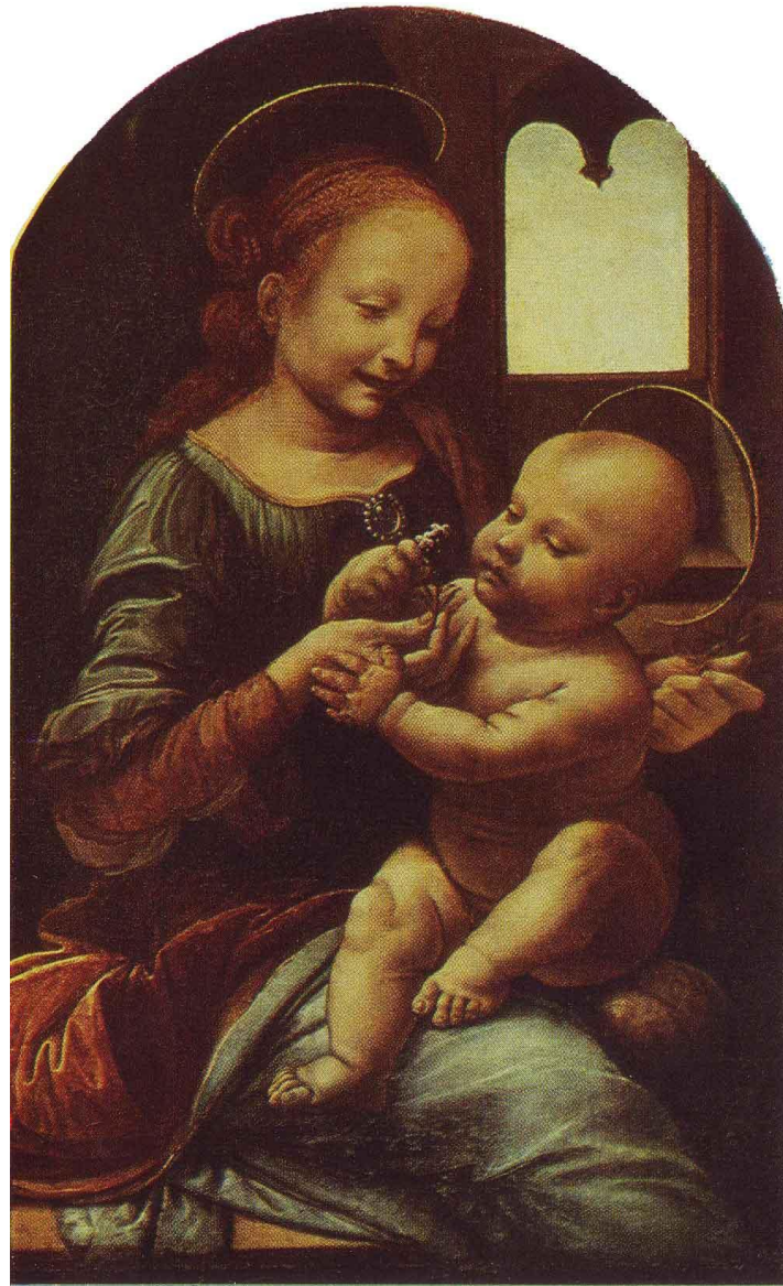
Leonardo Da Vinci. The Benois Madonna. 1478