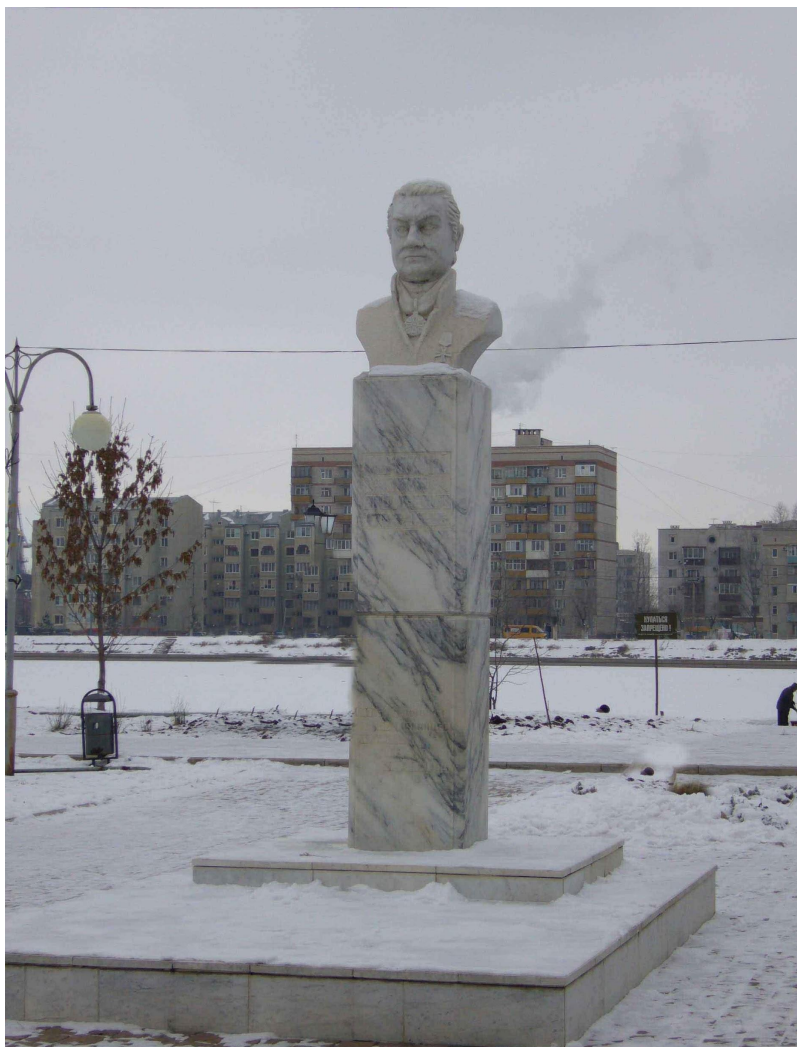
← Monument to I.A. Varvatsi from people of Astrakhan