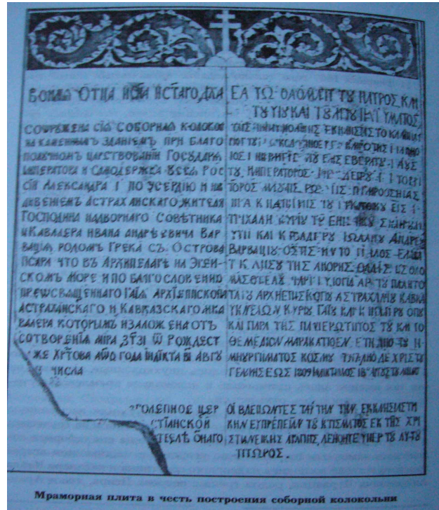
Мраморная плита в честь построения соборной колокольни