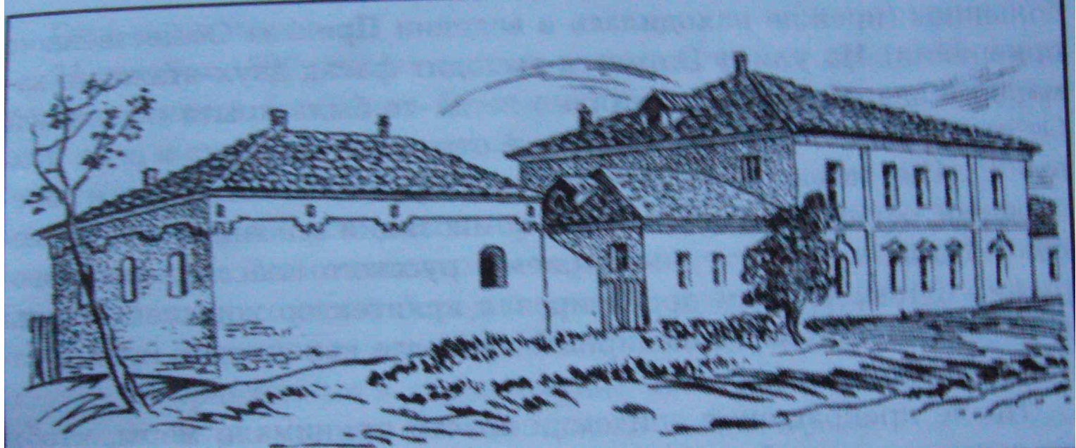
Hospital for widows and orphans on the Parobic hill (1792)