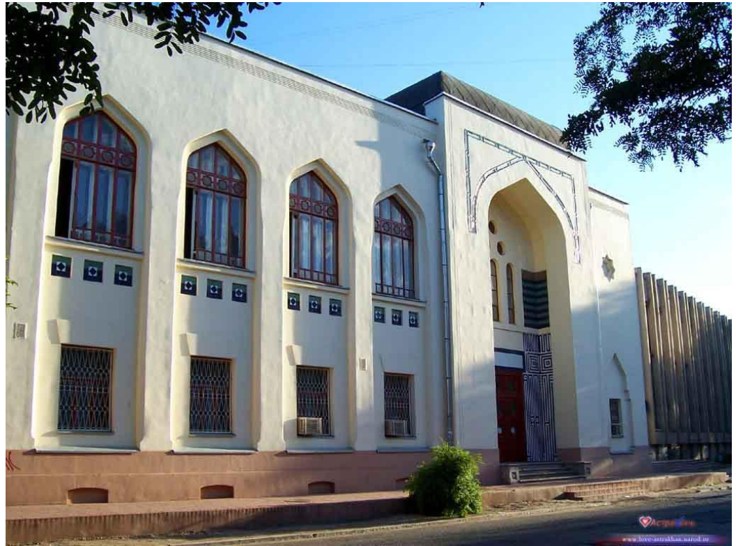
The Krupskaya regional scientific library