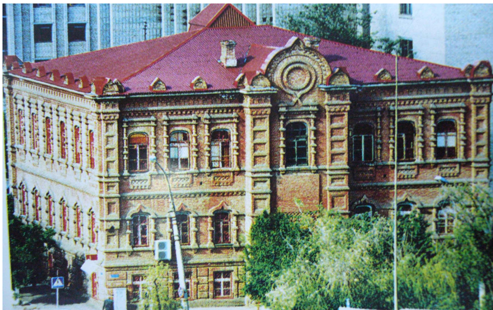
← Elizabethan orphanage 1896-1898