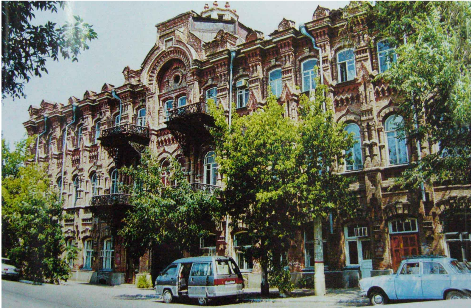
Polyclinic in Admiralteyskaya street (the building belonged to K.P. Vorobyov)