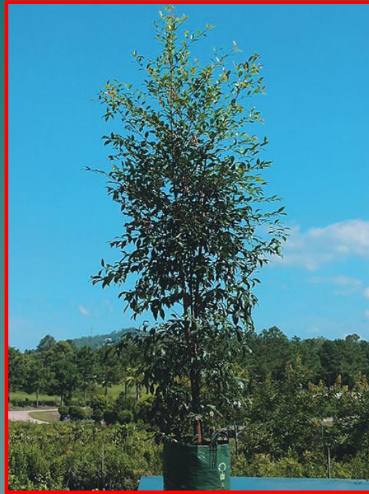
Trees without a shade