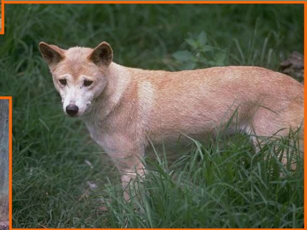
wild dog Dingo