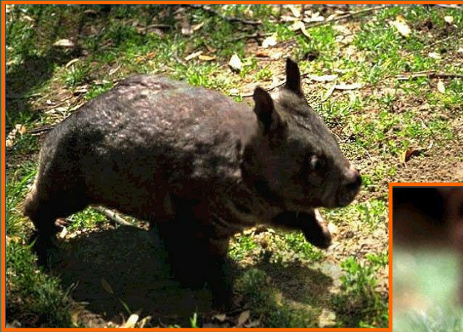
possums and wombats