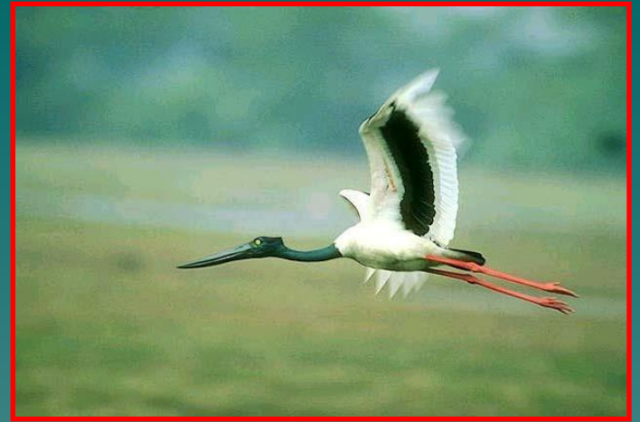
a black neck stork