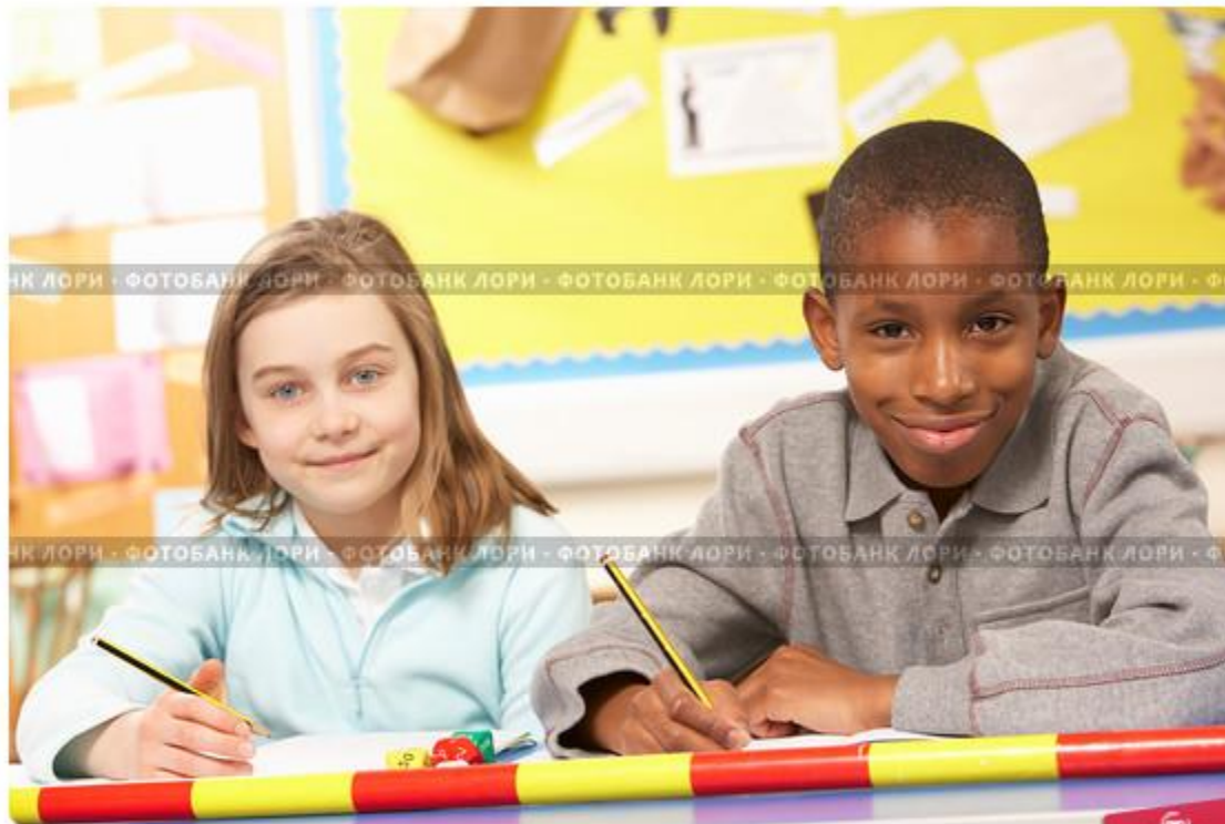
Двое школьников за партой - девочка и темнокожий мальчик