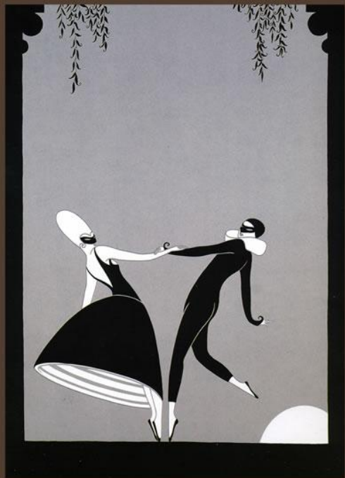
Chicago Opera Ballet