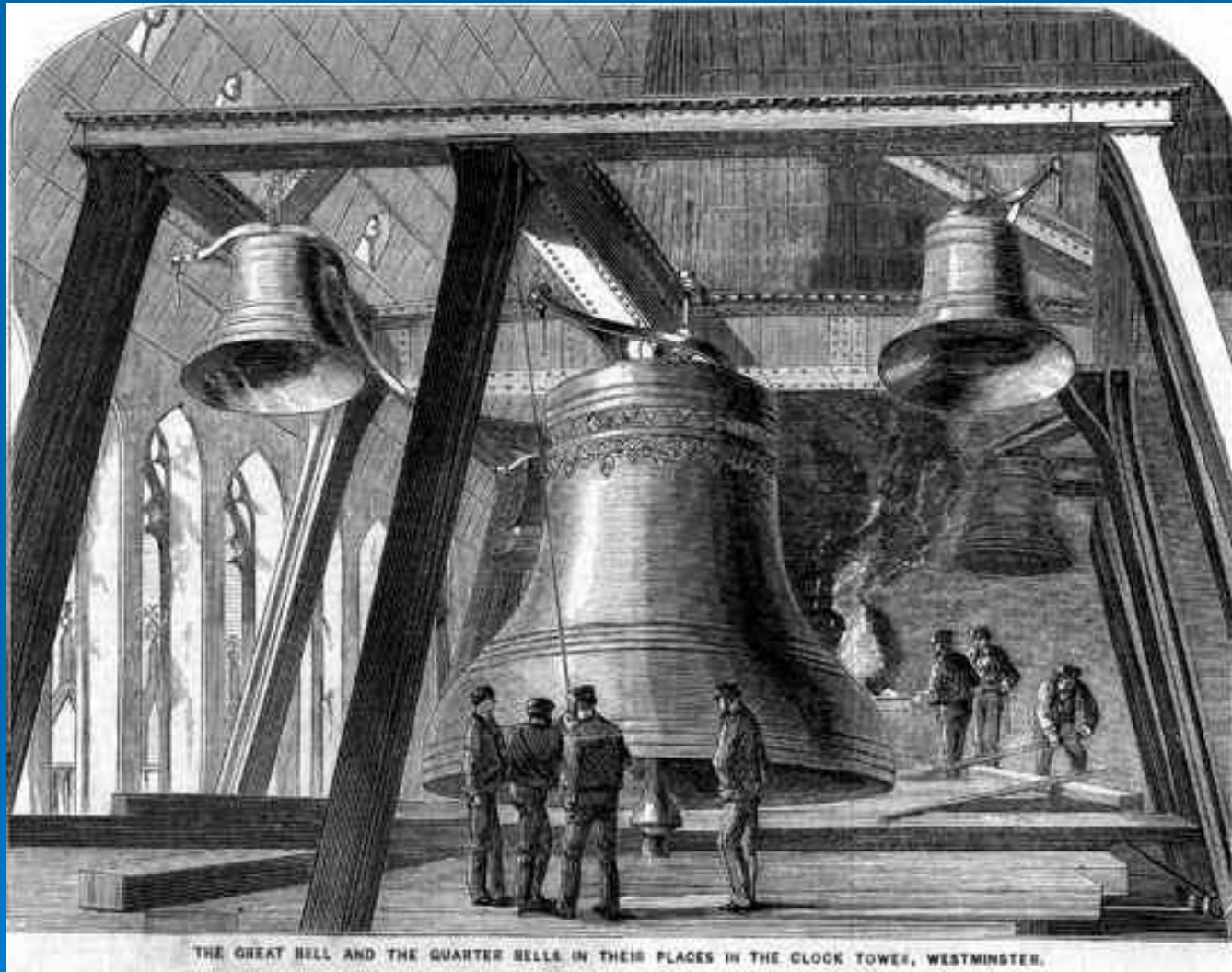
THE GREAT BELL AND THE QUARTER BELLS IN THEIR PLACES IN THE CLOCK TOWER, WESTMINSTER.

On top of the pendulum is a small stack of old penny coins; these are to adjust the time of the clock.