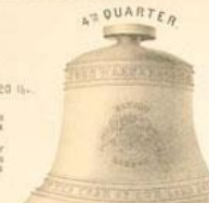
4 th QUARTER 60 IN. DIAMETER. NOTE C Natural. Weight 3 Tons 7 Cwt 10 Lbs 24 Lbs.

THE CLAPPER, WEIGHING 12 CWT., BEING TWICE THE USUAL WEIGHT IN PROPORTION TO THE BELL. THE TRUTH IS THAT THE DIFFERENCE IN THE SIZE OF THE CLAPPER IN THE CONSTRUCTION OF THE BELL, BEING A MUCH GREATER POWER BOTH OF BEATING BLOWS AND BEING SET INTO VIBRATION. — The London and the Daily Telegraph, March 10, 1859.