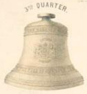
3 rd QUARTER 47 IN. DIAMETER. NOTE F Natural. Weight 1 Ton 13 Cwt 10 Lbs.

NOTE E NATURAL, AS CAST BY JOHN WARNER & SONS, BELL & BRASS FOUNDERS TO HER MAJESTY, CRESCENT FOUNDRY, LONDON.