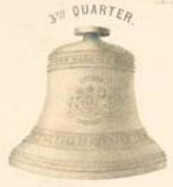
3 rd QUARTER 47. 6 th DIAMETER. NOTE F. Natural. Weight 1 Ton 13 Cwt 10 Lbs.