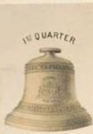
1 st QUARTER 31 IN. DIAMETER. NOTE A Natural. Weight 1 Ton 1 Cwt.

BIG BEN THE LARGEST BELL EVER CAST IN ENGLAND AND THE FOUR QUARTER BELLS FOR THE CLOCK TOWER OF THE NEW HOUSES OF PARLIAMENT.