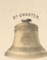
2 nd QUARTER 40 IN. DIAMETER. NOTE G. Nat. Weight 1 Ton 6 Cwt.

BIG BEN THE LARGEST BELL EVER CAST IN ENGLAND AND THE FOUR QUARTER BELLS FOR THE CLOCK TOWER OF THE NEW HOUSES OF PARLIAMENT.