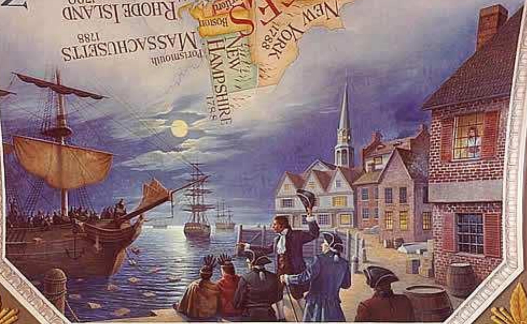
BOSTON TEA PARTY. 1773

WEST TERRITORY CONNECTICUT RESERVE PENNSYLVANIA 1787 NEW YORK 1788 NEW HAMPSHIRE 1794 MASSACHUSETTS 1788 RHODE ISLAND 1790 CONNECTICUT 1788 NEW JERSEY 1787 NEW YORK HARTFORD BOSTON PORTSMOUTH PROVIDENCE TRENTON NEW YORK PHILADELPHIA