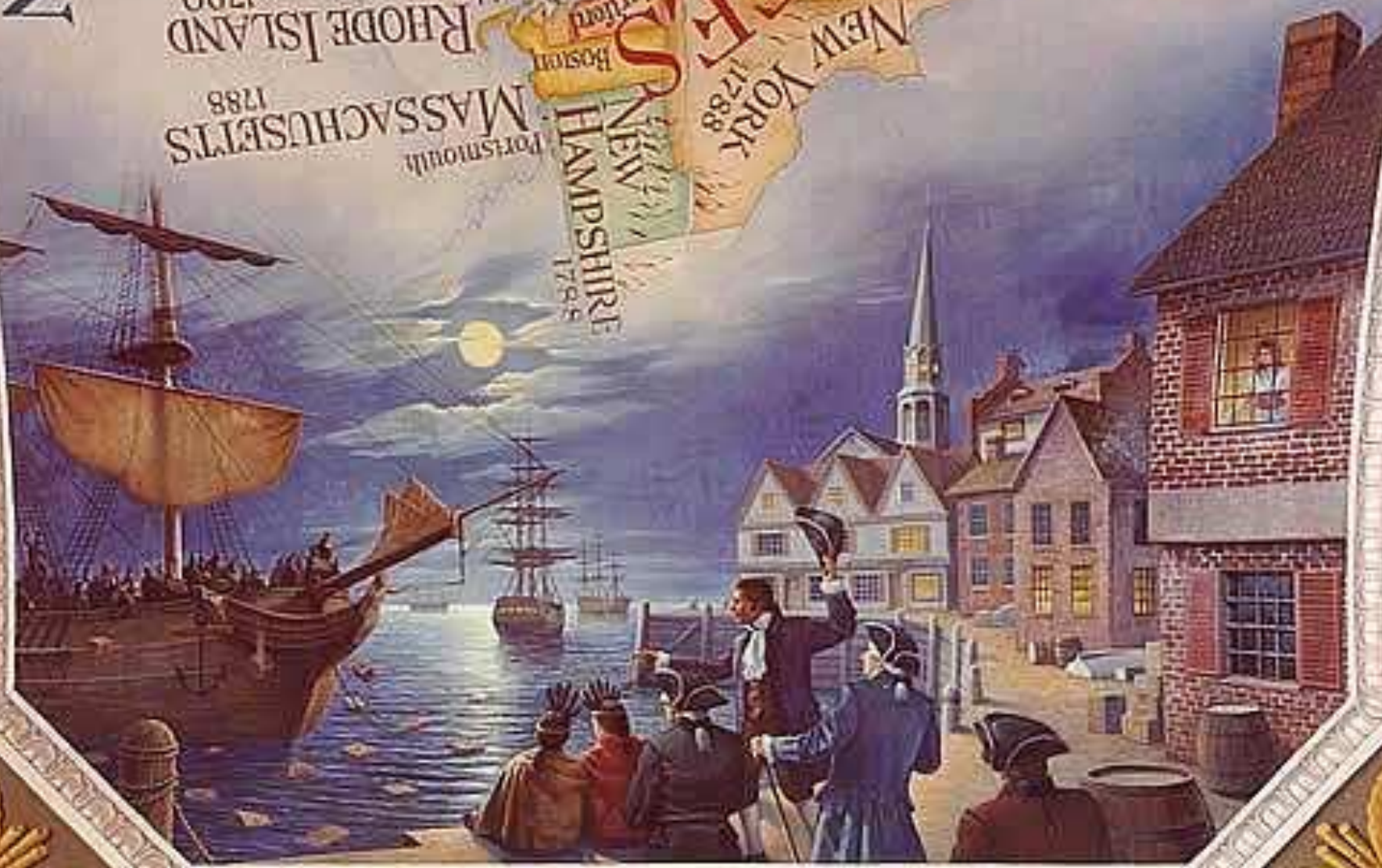
BOSTON TEA PARTY. 1773

WEST TERRITORY CONNECTICUT RESERVE VANIA 1787 PENNSYLVANIA NEW YORK 1788 NEW HAMPSHIRE 1794 MASSACHUSETTS 1788 RHODE ISLAND 1790 CONNECTICUT 1788 NEW JERSEY 1787 New York Trenton Philadelphia Boston Providence Hartford