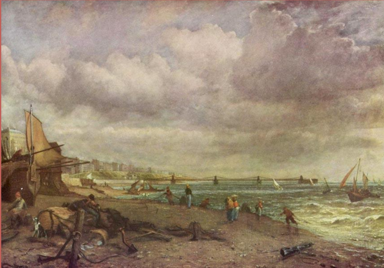
« Marine Parade and Old Chain Pier, Brighton »