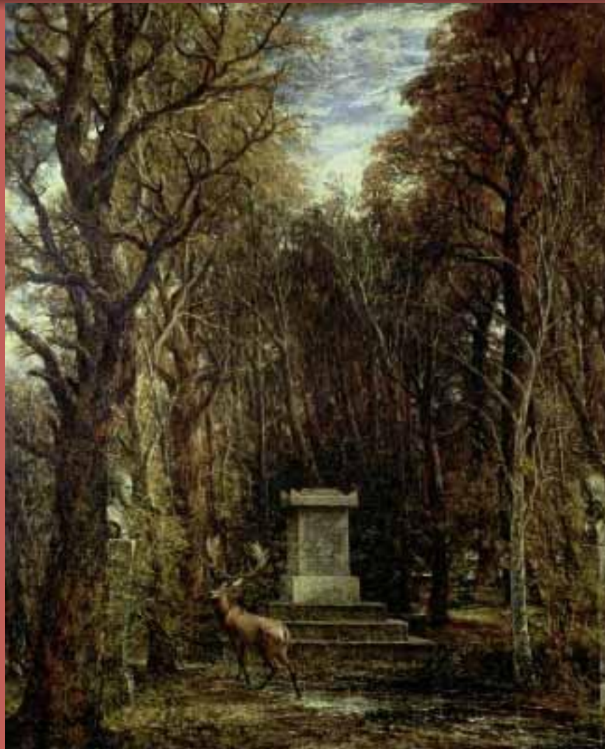
« Cenotaph to the Memory of Sir Joshua Reynolds »