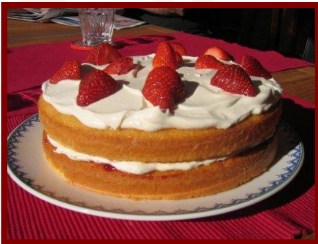
The Victoria Sponge Named after Queen Victoria

Although many foreigners find British food disgusting, British teenagers in the survey enjoy eating bacon sandwiches, baked beans, cheddar cheese and curry (well, it's not British but it is one of Britain's most popular foods). Also, we know it's a British stereotype but many British teenagers still like drinking a nice cup of tea in the morning.