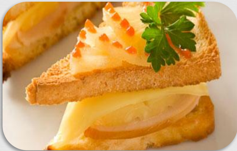
Slice of toast.