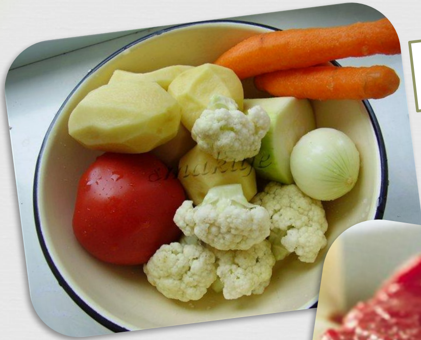
Potatoes, carrots, tomatoes, cabbages and onions.