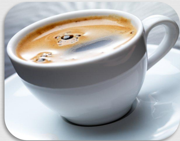
Cup of coffee.