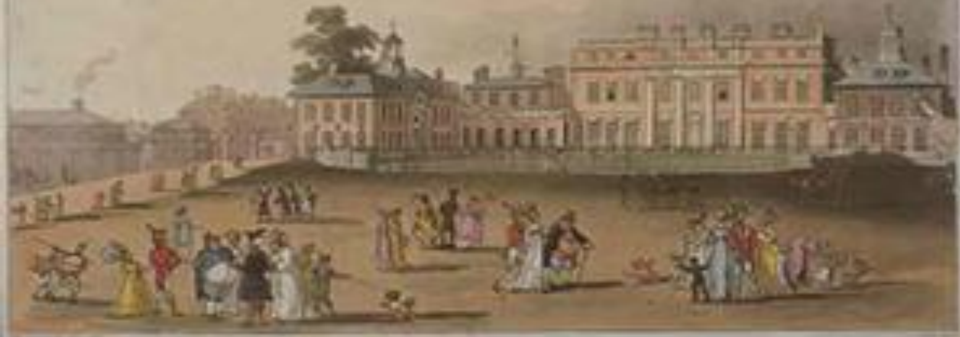
BUCKINGHAM PALACE FROM THE GARDENS