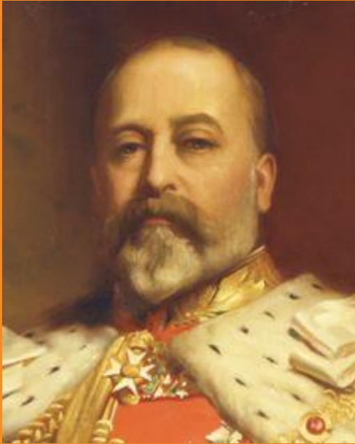
King Edward VII.