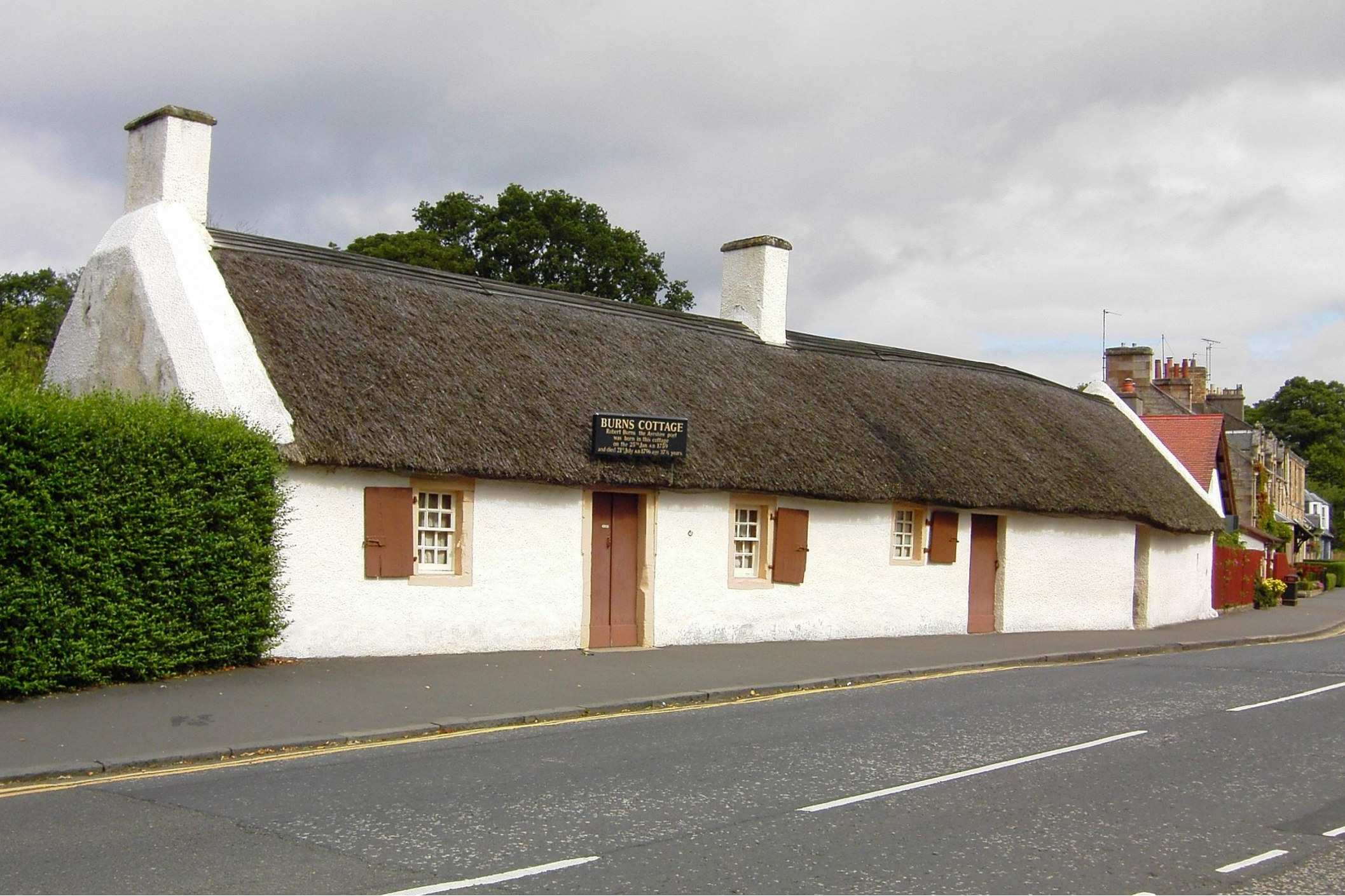
Burns`s cottage. Alloway