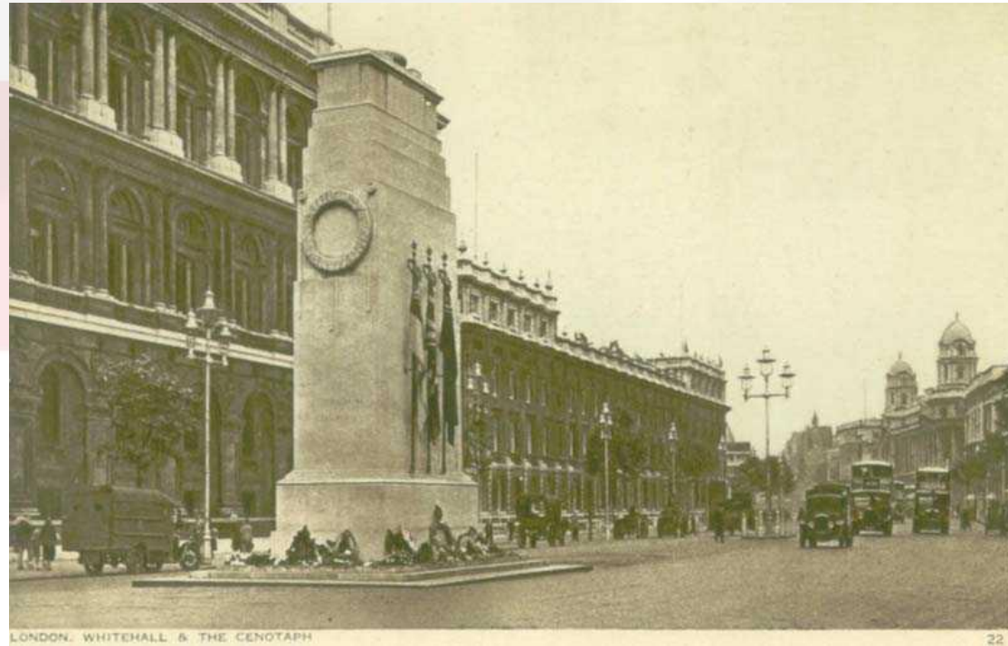
LONDON. WHITEHALL & THE CENOTAPH