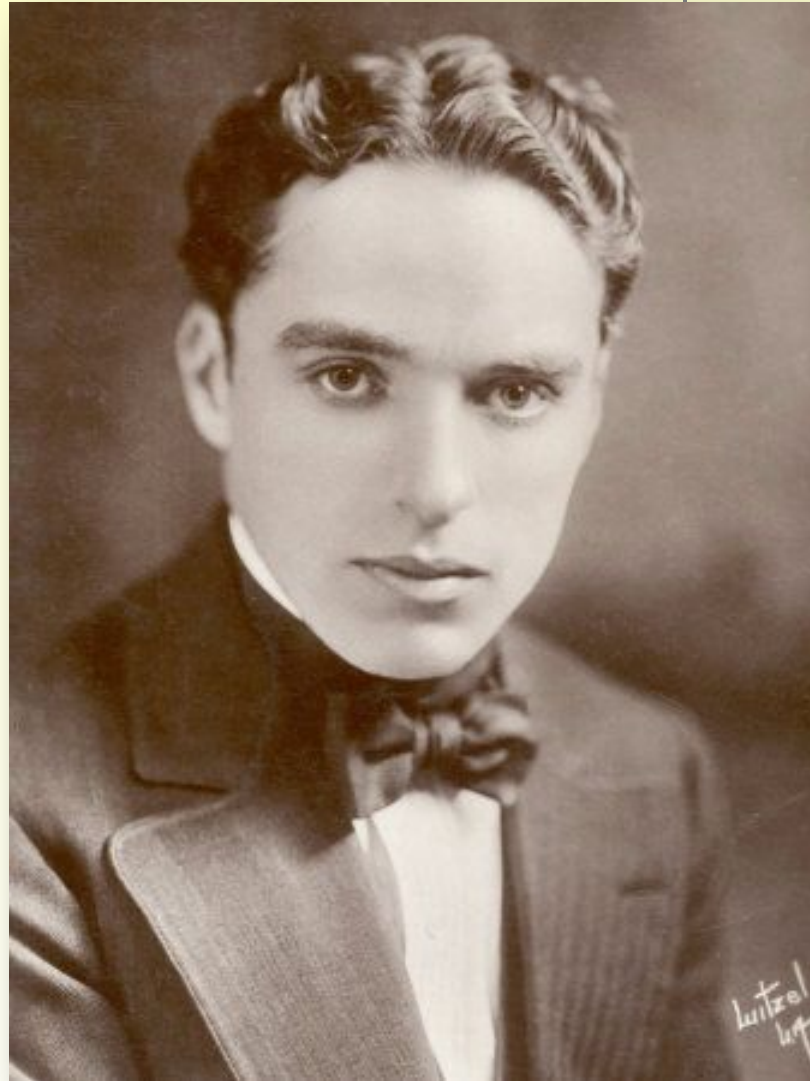
Charles Spenser Chaplin