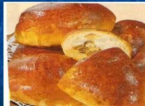
hot mince pies