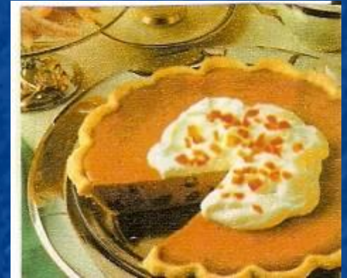
a Christmas cake