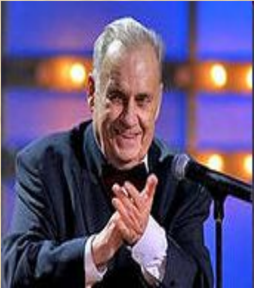
Eldar Ryazanov 1927 -