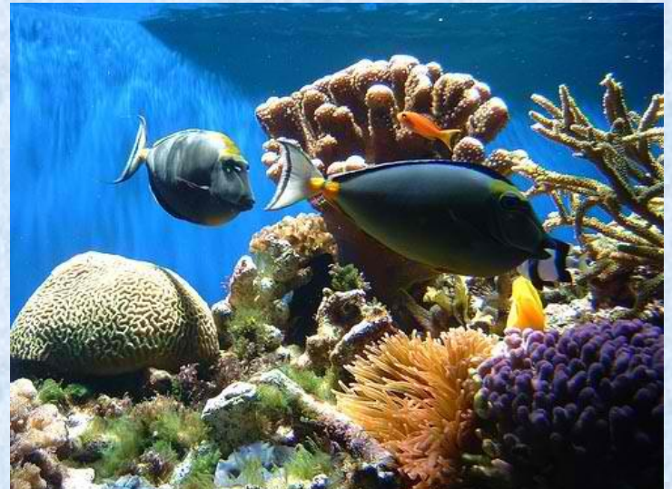
Jamaican coral reef scene