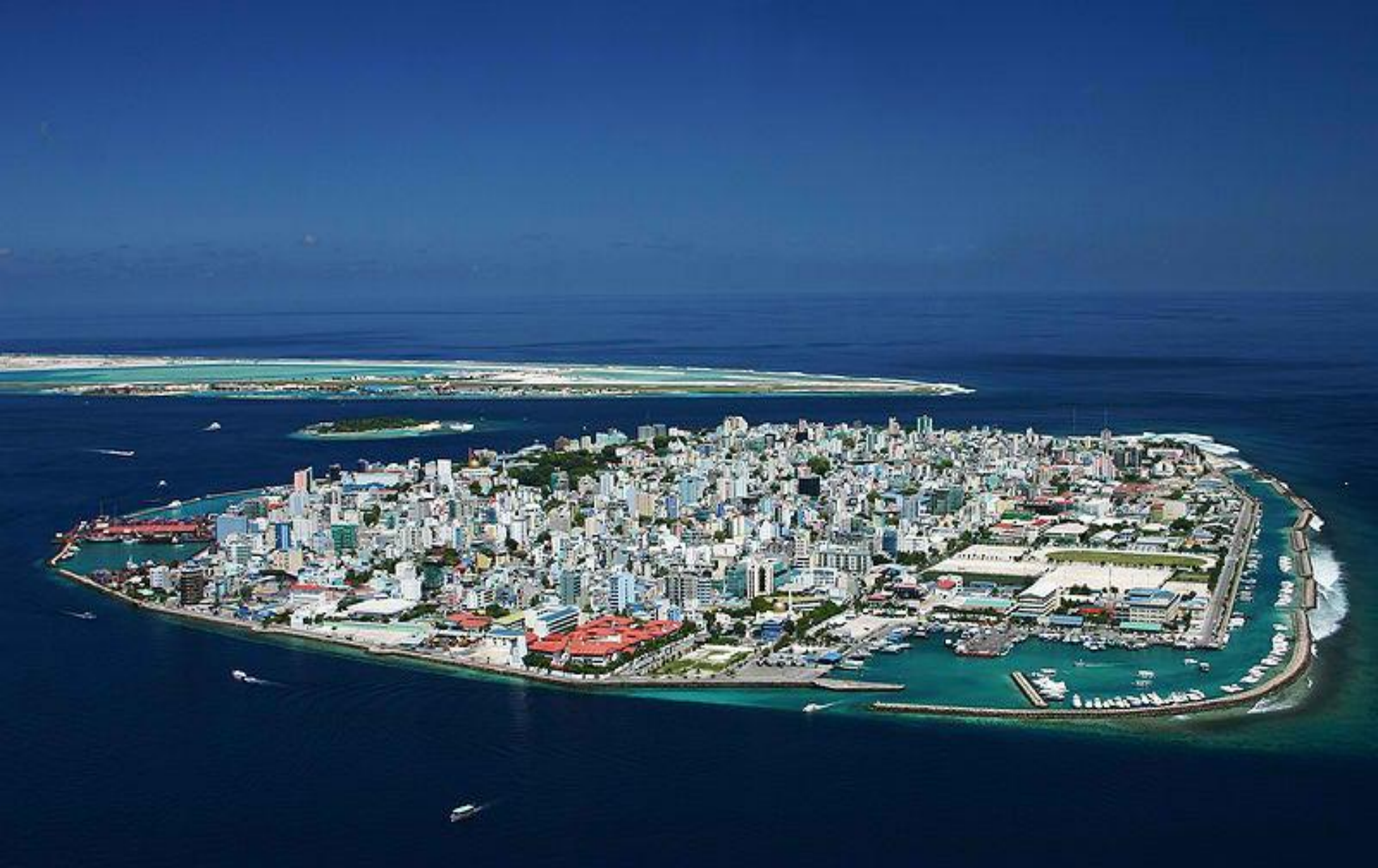
Malé, the capital of the Maldives