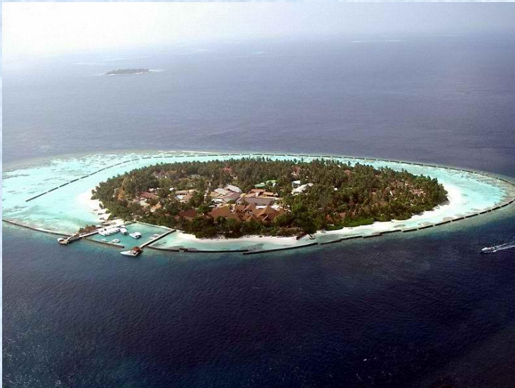
Kurumba Island, Maldives