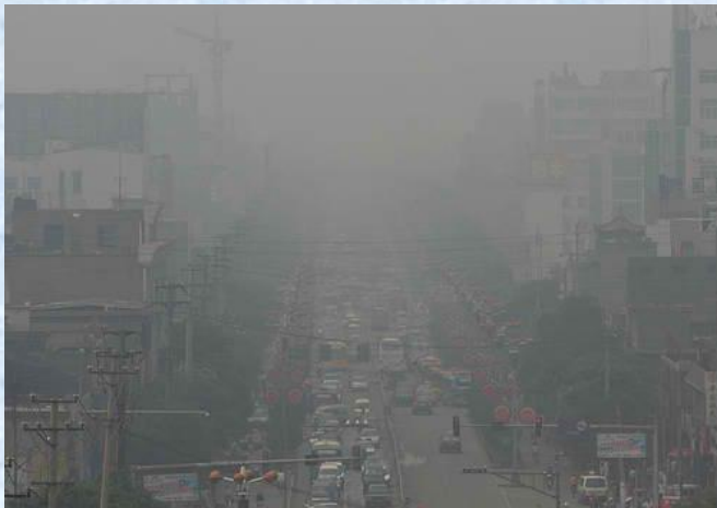
Linfen, China The most polluted city in the world