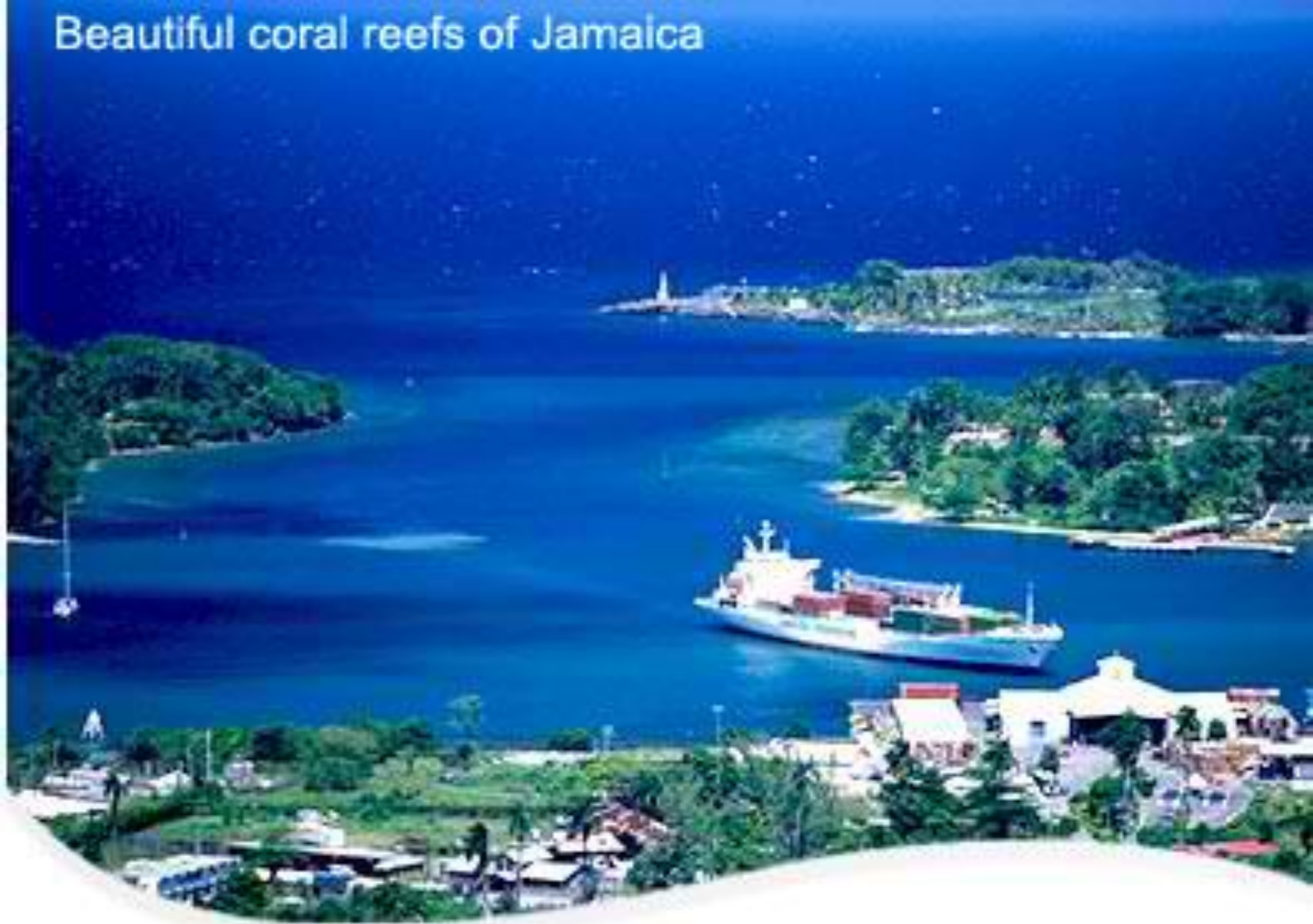
Beautiful coral reefs of Jamaica