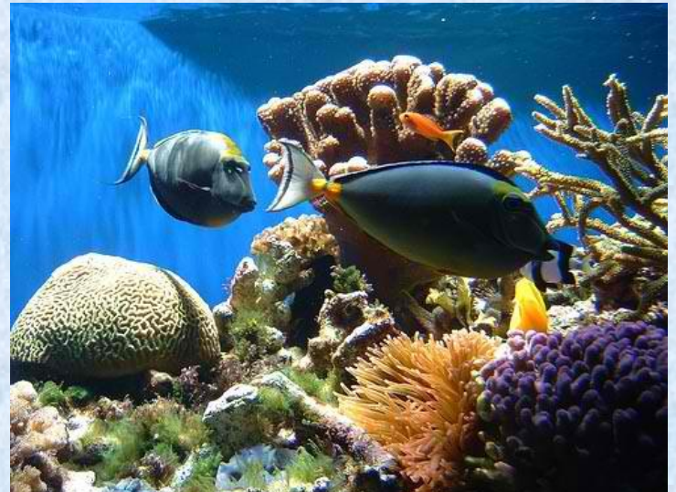
Jamaican coral reef scene