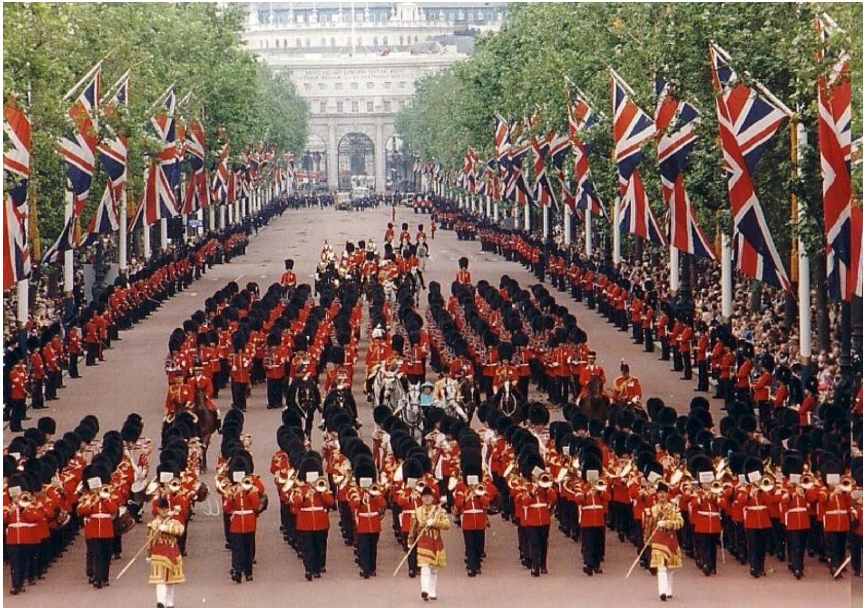
So does the military ceremony of "Trooping the colour".