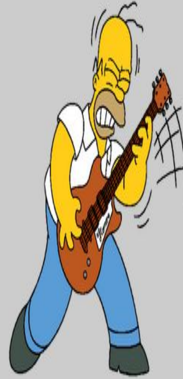
Homer 39 years old 80 kilos 1.55 mt