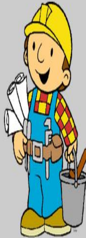
Bob 28 years old 55 kilos 1.50 mt