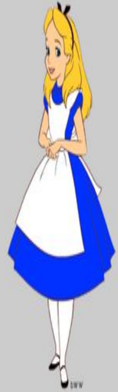
Alice 9 years old 33 kilos 1.20 mt