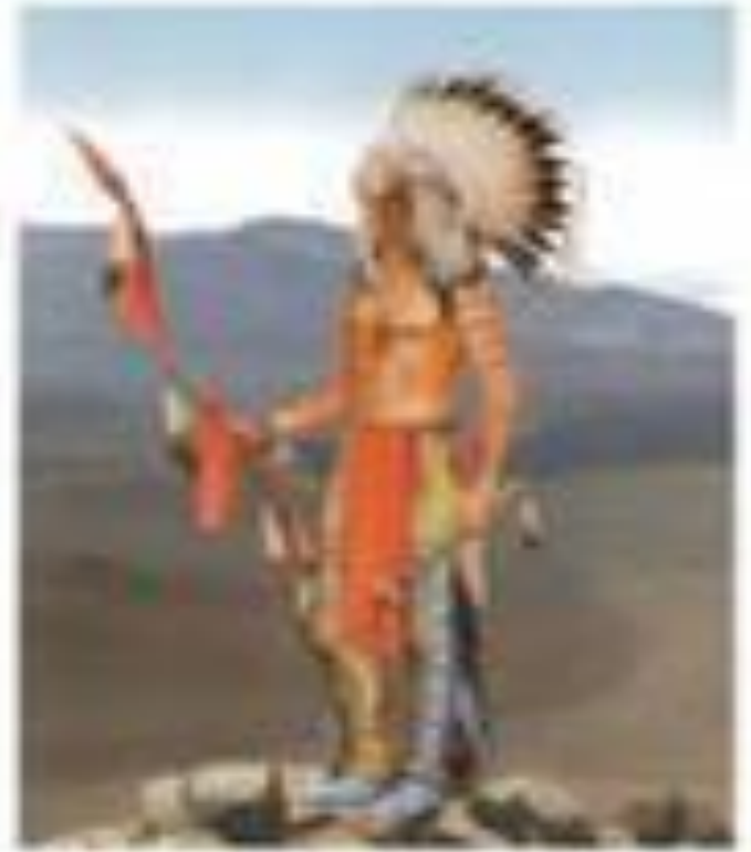
[Faint, illegible text caption]