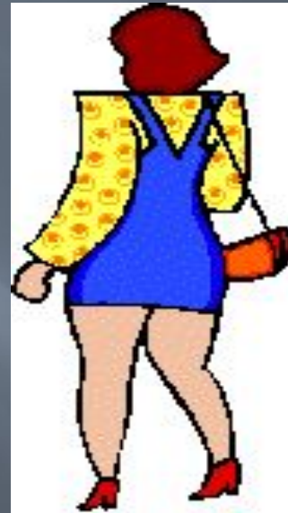
She is fat.