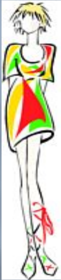
She is slim.