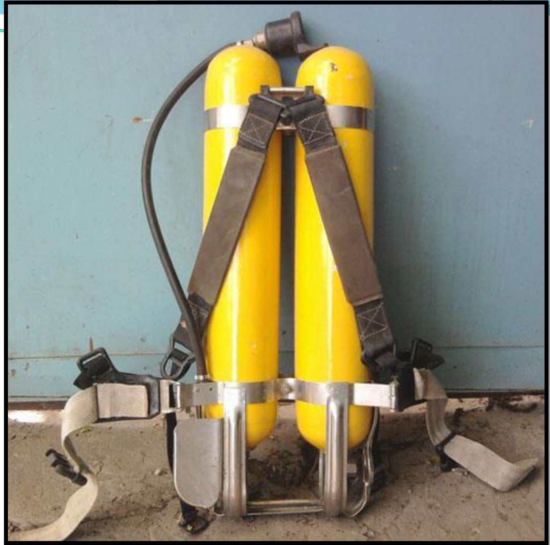
1943 - Jacques-Yves Cousteau and Emile Gagnan invented the aqualung