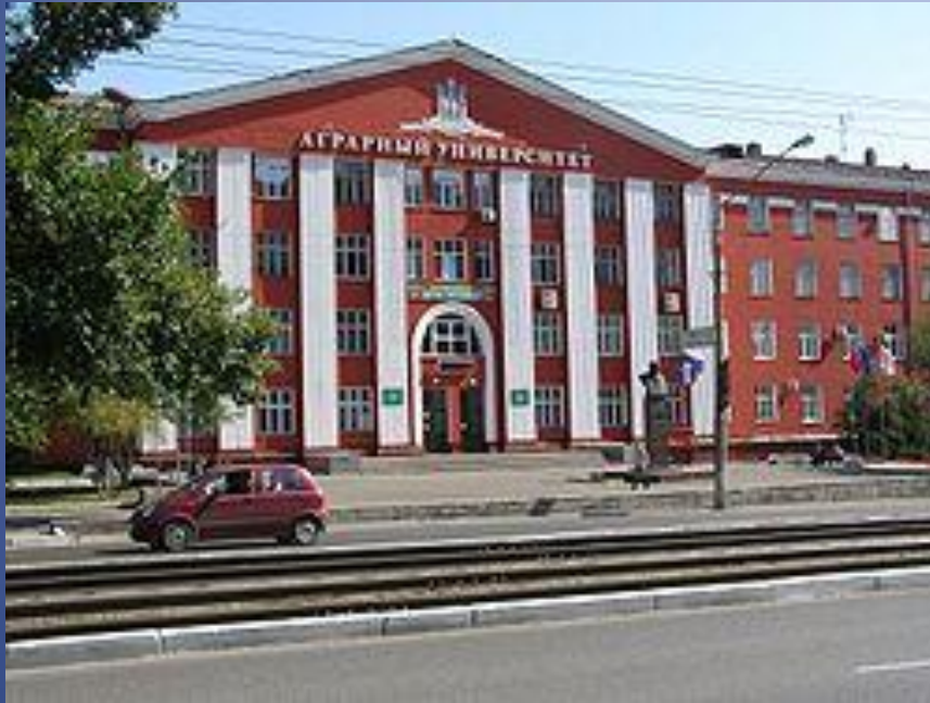
The Altai State Agrarian University