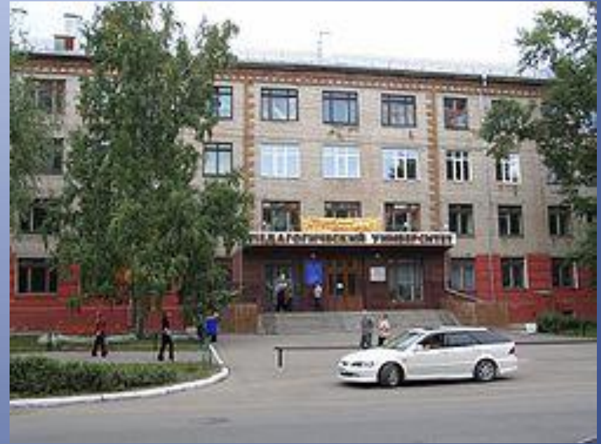
Altai State Pedagogical Academy