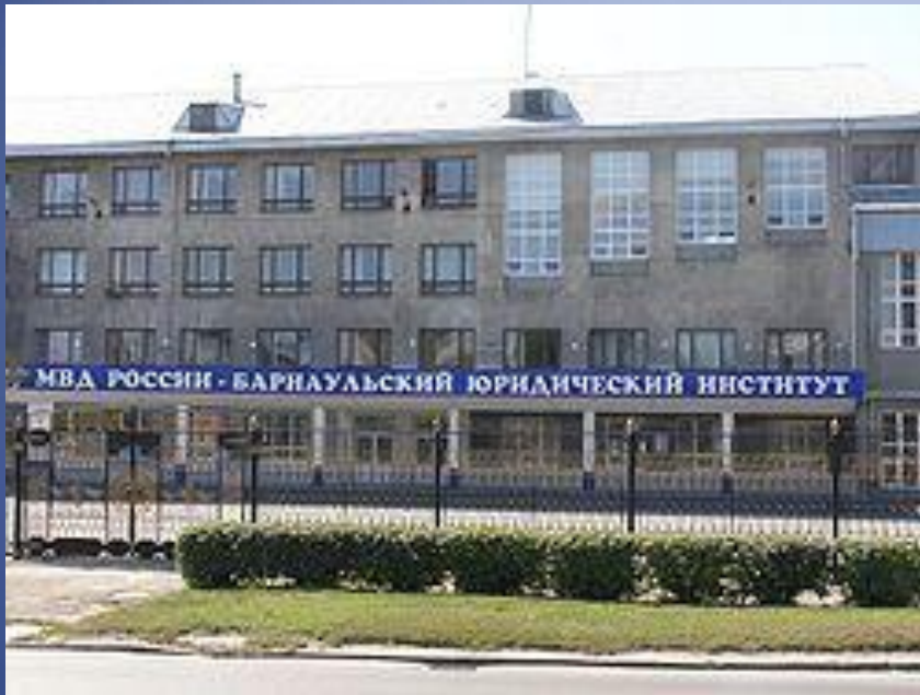
Barnaul Institute of Law, Ministry of Internal Affairs of Russia