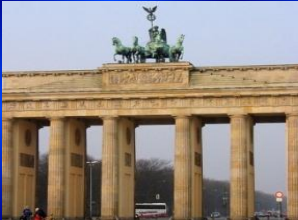
The Brandenburg gate