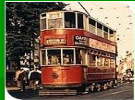
Double-decker bus in 1896