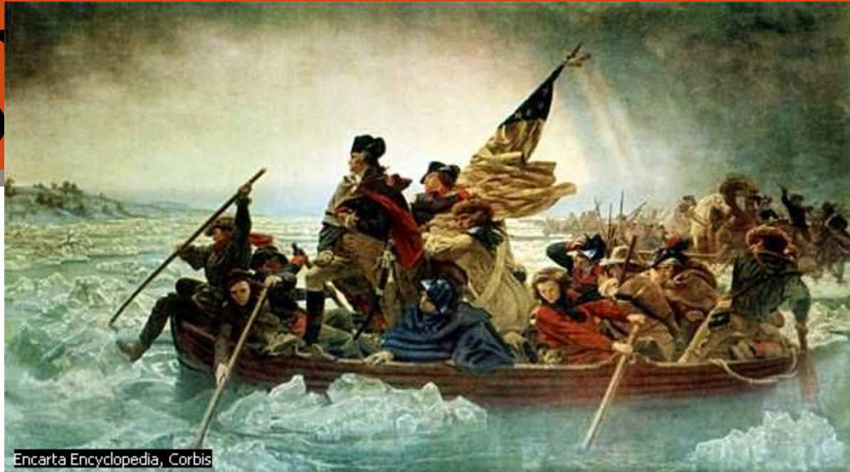
Encarta Encyclopedia, Corbis