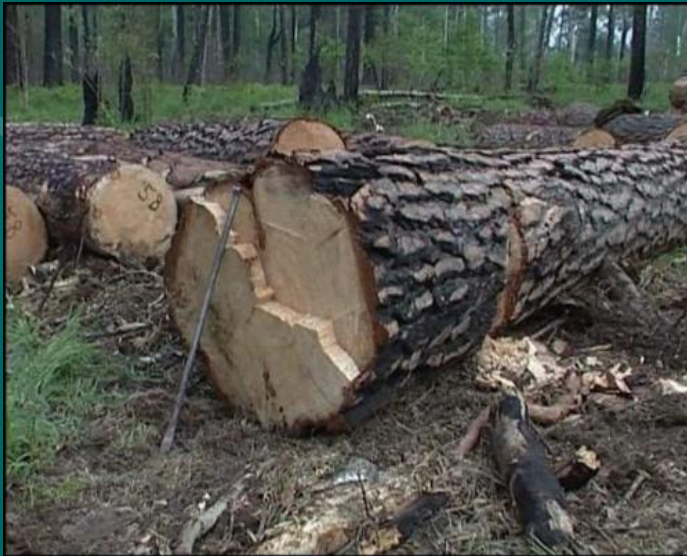
Trees are cut down