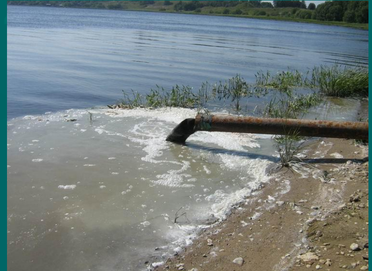
Water and land pollution