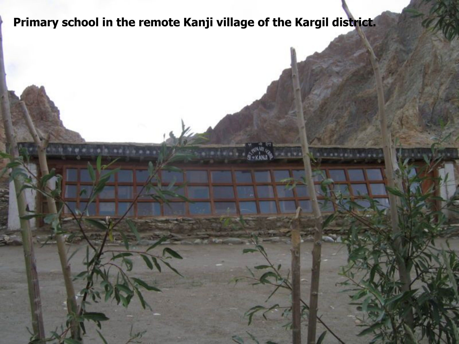
Primary school in the remote Kanji village of the Kargil district.