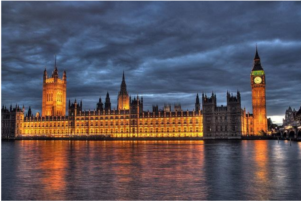
Houses of Parliament, London View of Victoria Tower to the left, and the Houses of Parliament and Big Ben to the right.