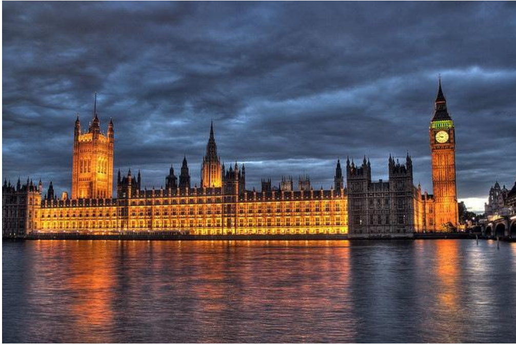
Houses of Parliament, London View of Victoria Tower to the left, and the Houses of Parliament and Big Ben to the right.