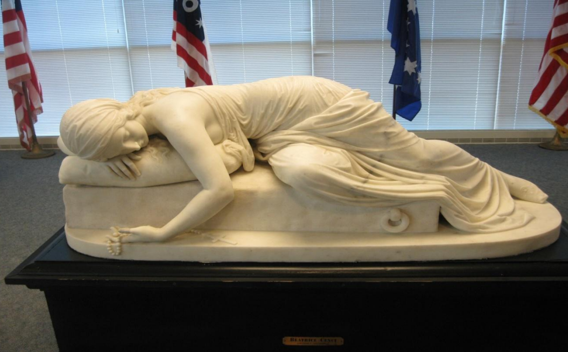
The sculpture of Beatrice Cenci