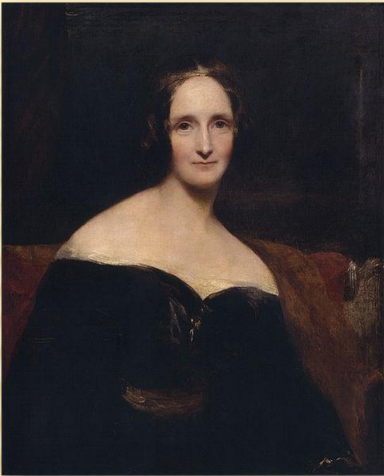
Shelley's second wife, Mary Shelley, the author of Frankenstein .