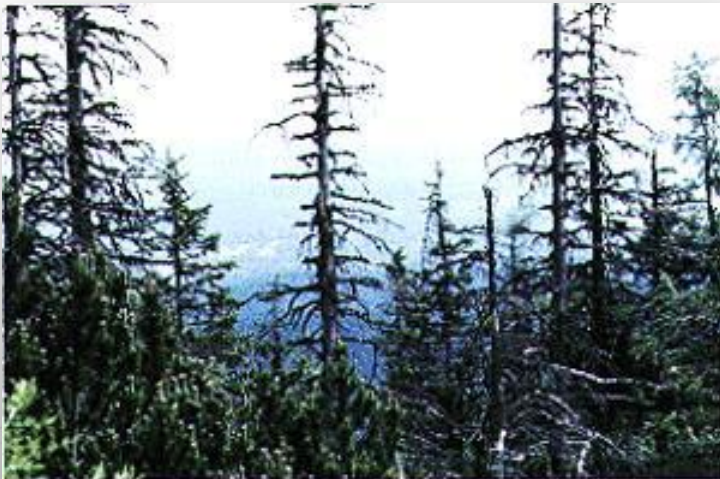
Acid rain withers trees in a coniferous forest in Europe.