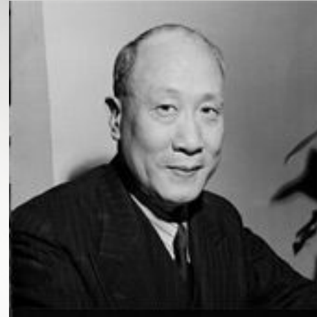
Dr. Peng-chun Chang (China)