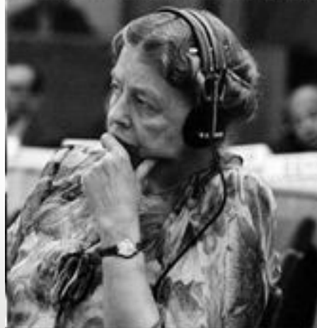
Eleanor Roosevelt (US)