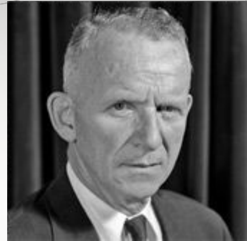
John P. Humphrey (Canada)