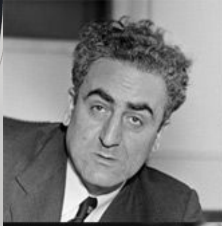
Dr. Charles Malik (Lebanon)