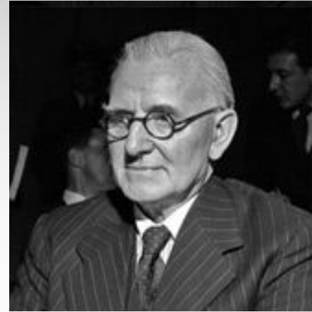
Charles Dukes (United Kingdom)