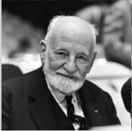
René Cassin (France)