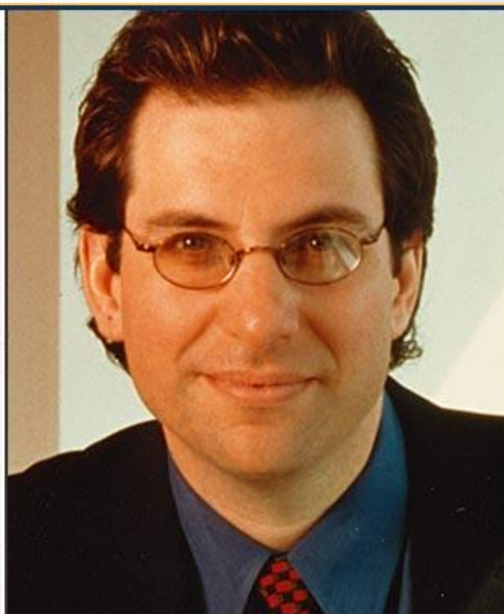
* Kevin Mitnick