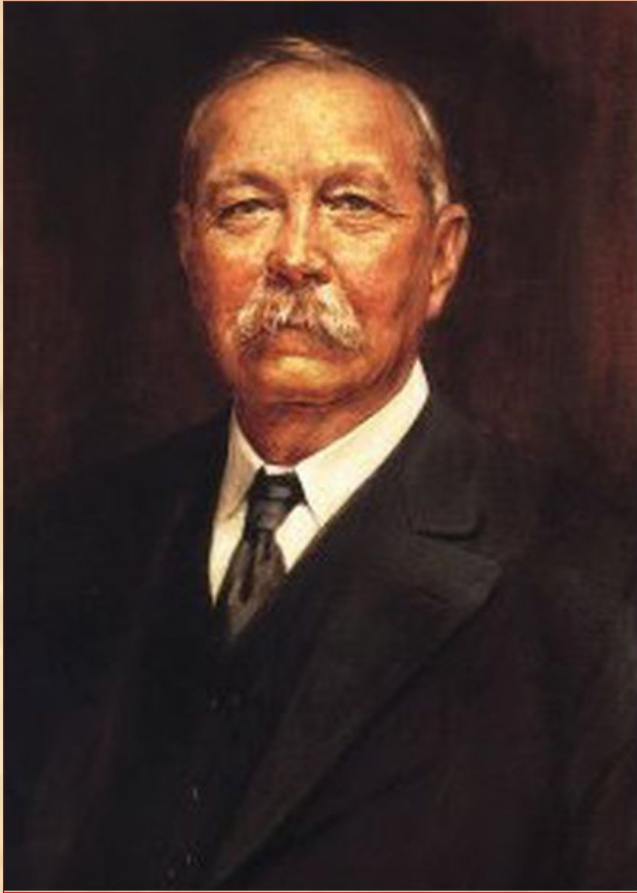
Arthur Conan Doyle