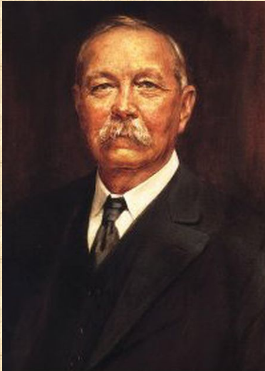
Arthur Conan Doyle