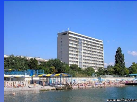
Park Sanatorium of Ministry of Defence