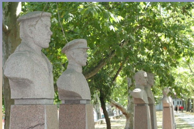
■ Avenue of heroes