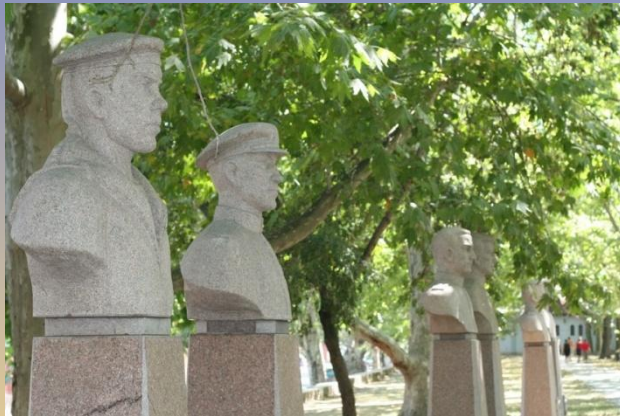
■ Avenue of heroes