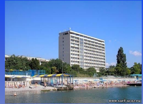
Park Sanatorium of Ministry of Defence